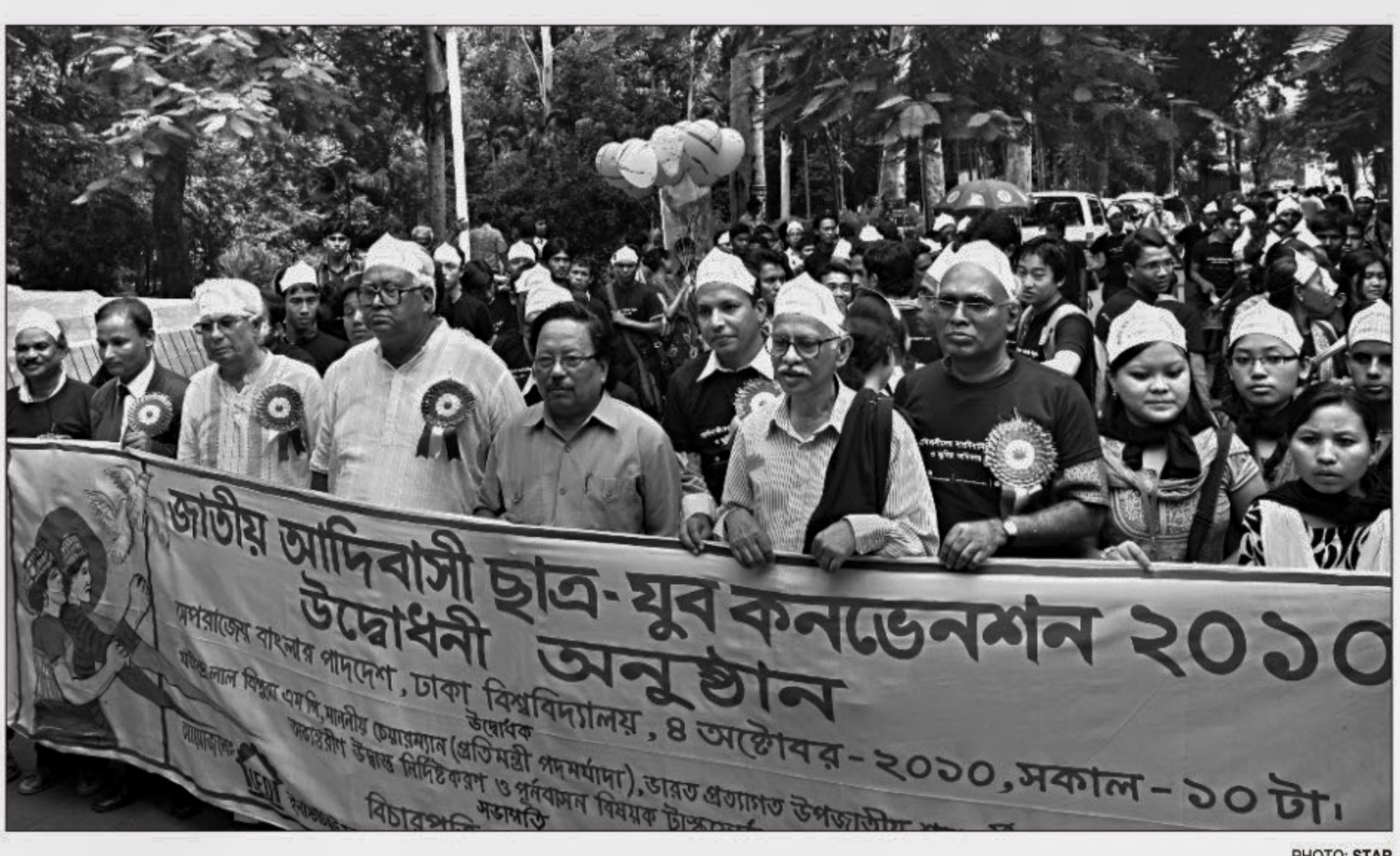
People from different indigenous communities bring out a rally from Dhaka University yesterday on the occasion of Jatiya Adivasi Chhatra-Jubo Convention 2010.