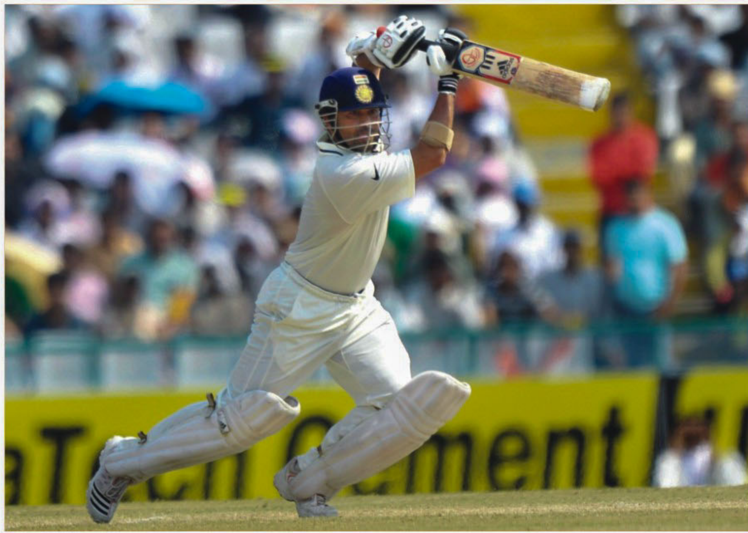
Sachin Tendulkar executes a copybook cover drive on the third day of the opening Test against Australia in Mohali yesterday. The master batsman missed what could have been his 49th century by just two runs.