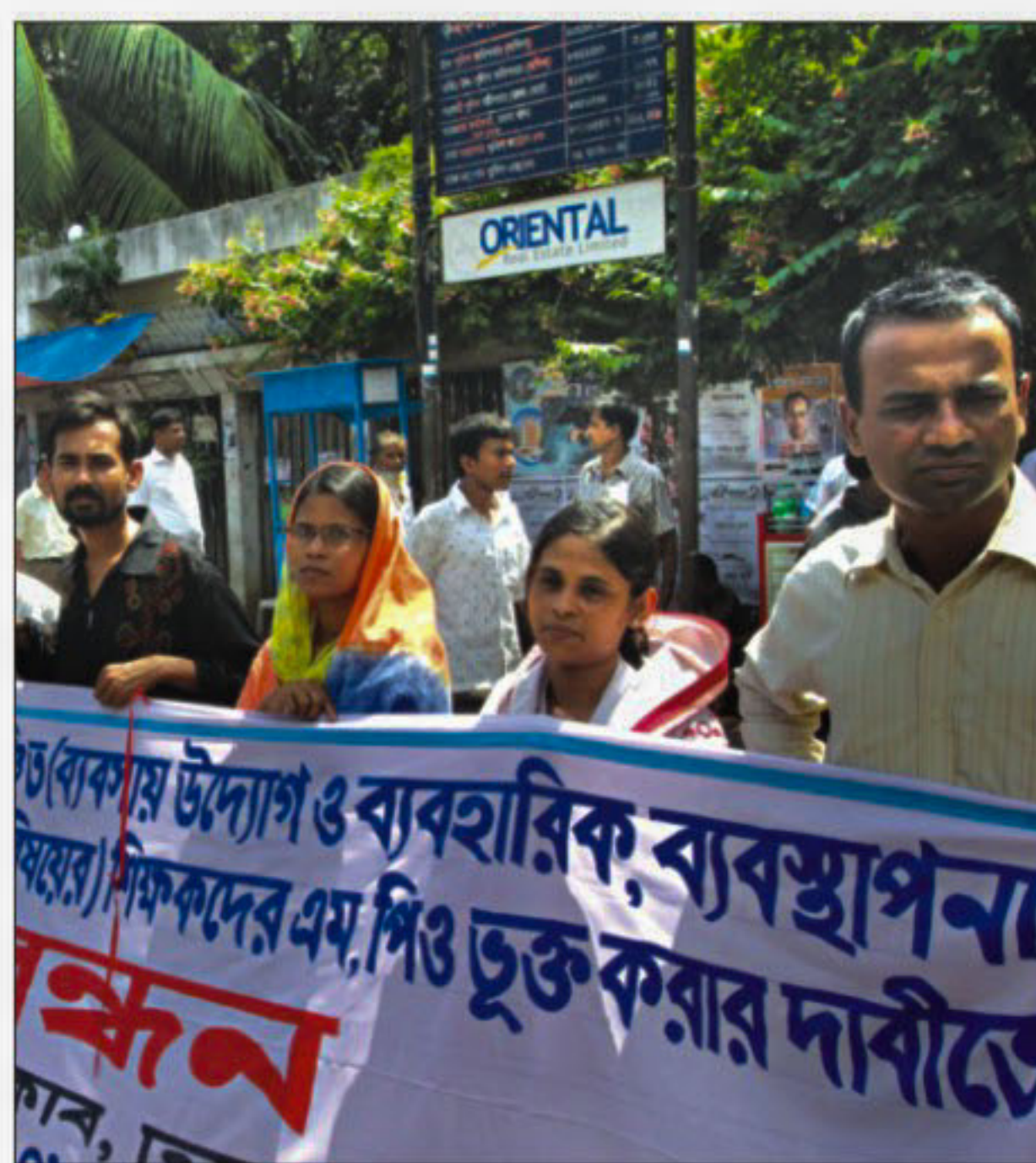
Physical Teachers Forum forms a human chain in front of the National Press Club in the city yesterday demanding inclusion of the deprived teachers in the monthly pay order (MPO) facilities.

There was mark of injuries inflicted by blunt weapons behind his head.