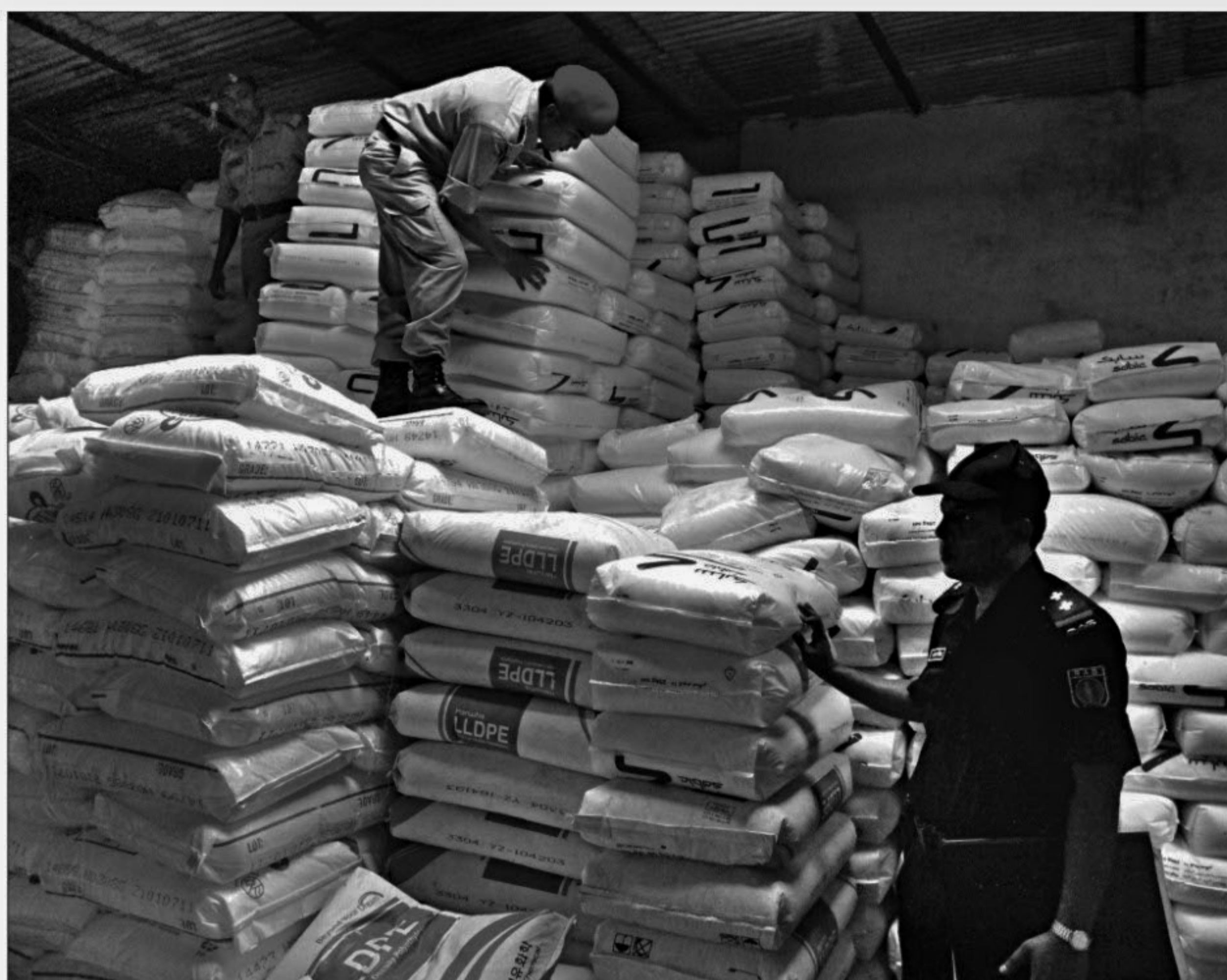
A mobile court yesterday, during a drive against warehouses of combustible chemicals in the city's residential areas, fined this warehouse of Abdul Gaffar Company at Hosne Dalan. Used for storing plastic, for not keeping fire extinguishers there. (Story on Page 1)

JICA have initiated a project titled Bangladesh Digital Mapping Assistance Project (BDMAP) to give technical and logistic support to SOB to implement digitalised mapping system.