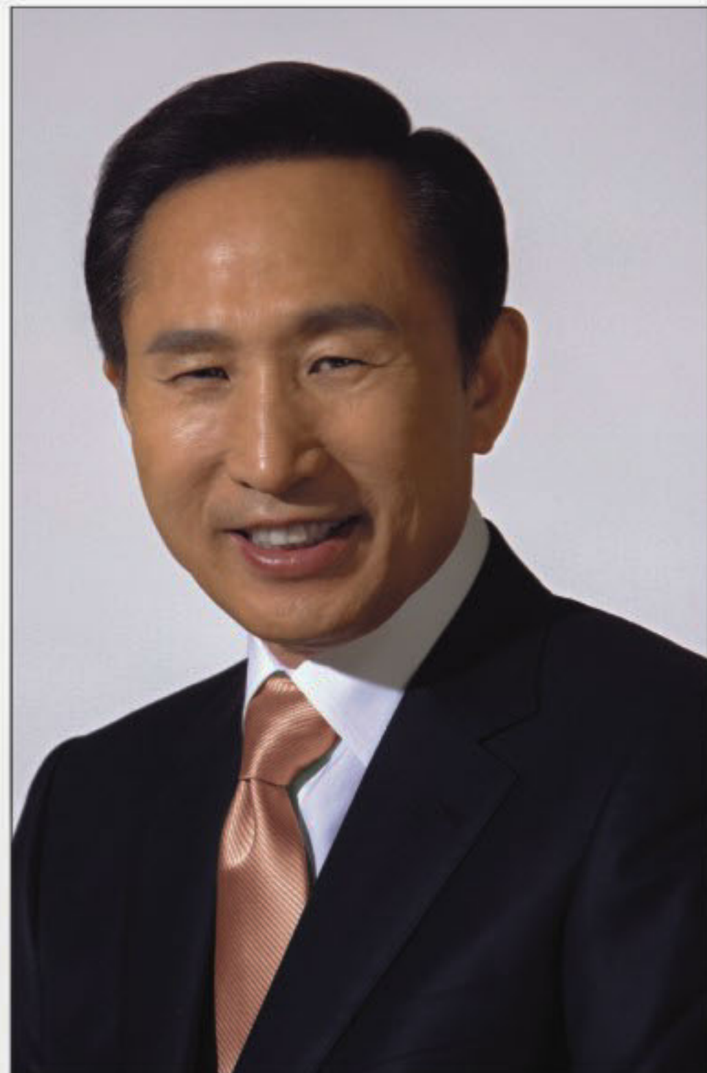
Lee Myung-bak President of the Republic of Korea