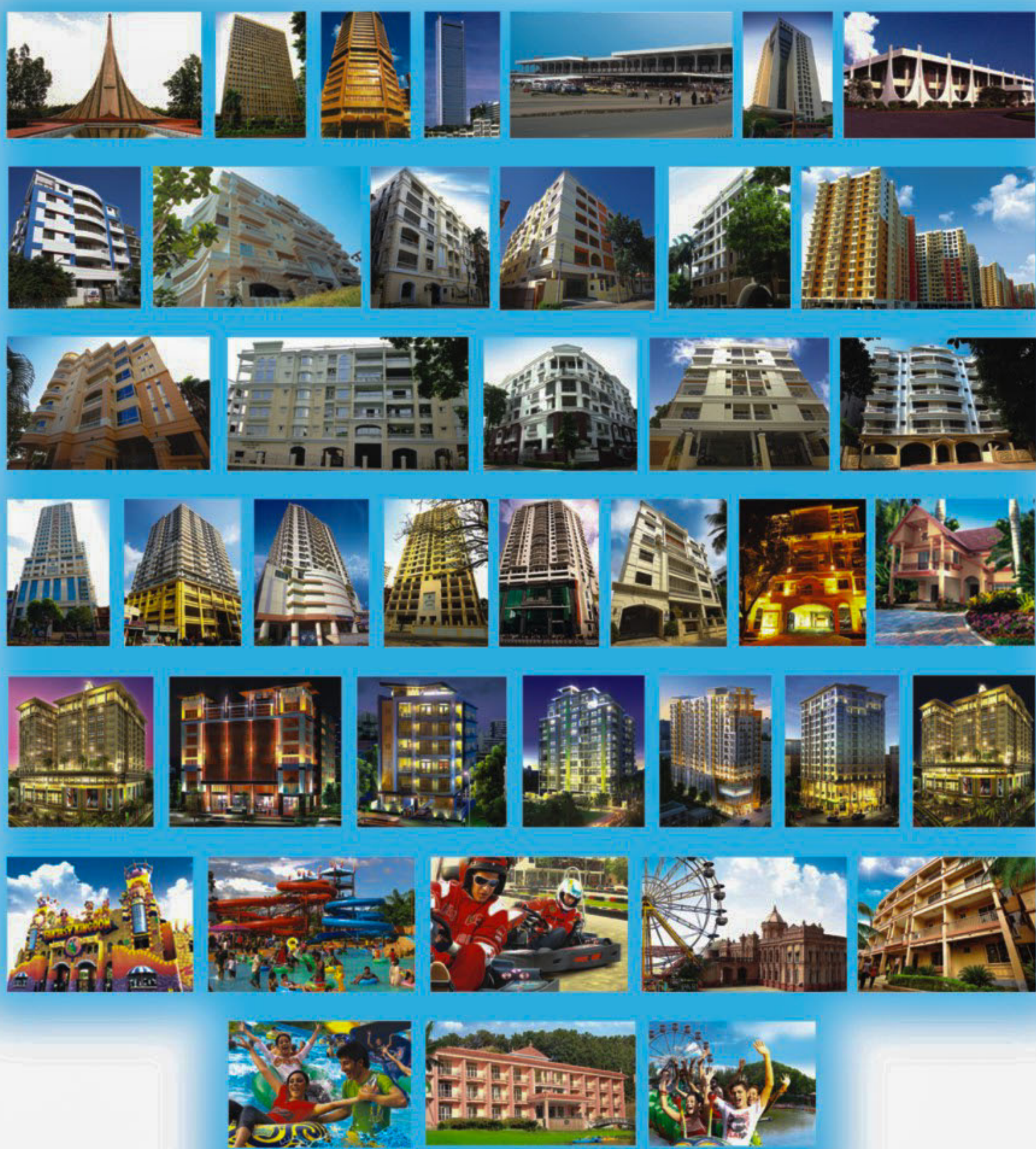
SOME OF OUR PROJECTS