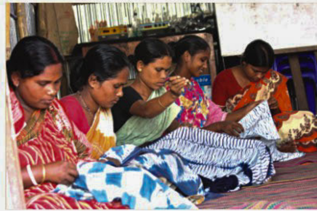
Top, Indigo fields at Rajendrapur in Rangpur. A number of farmers in the area are cultivating the plant and producing dye from it. Bottom left, Colouring cloths with the dye what the farmers call True Bengal Natural Indigo Dye. Bottom right, Women at Nijera Cottage and Village Industries are stitching dyed cloths. The photos were taken at the end of last year.