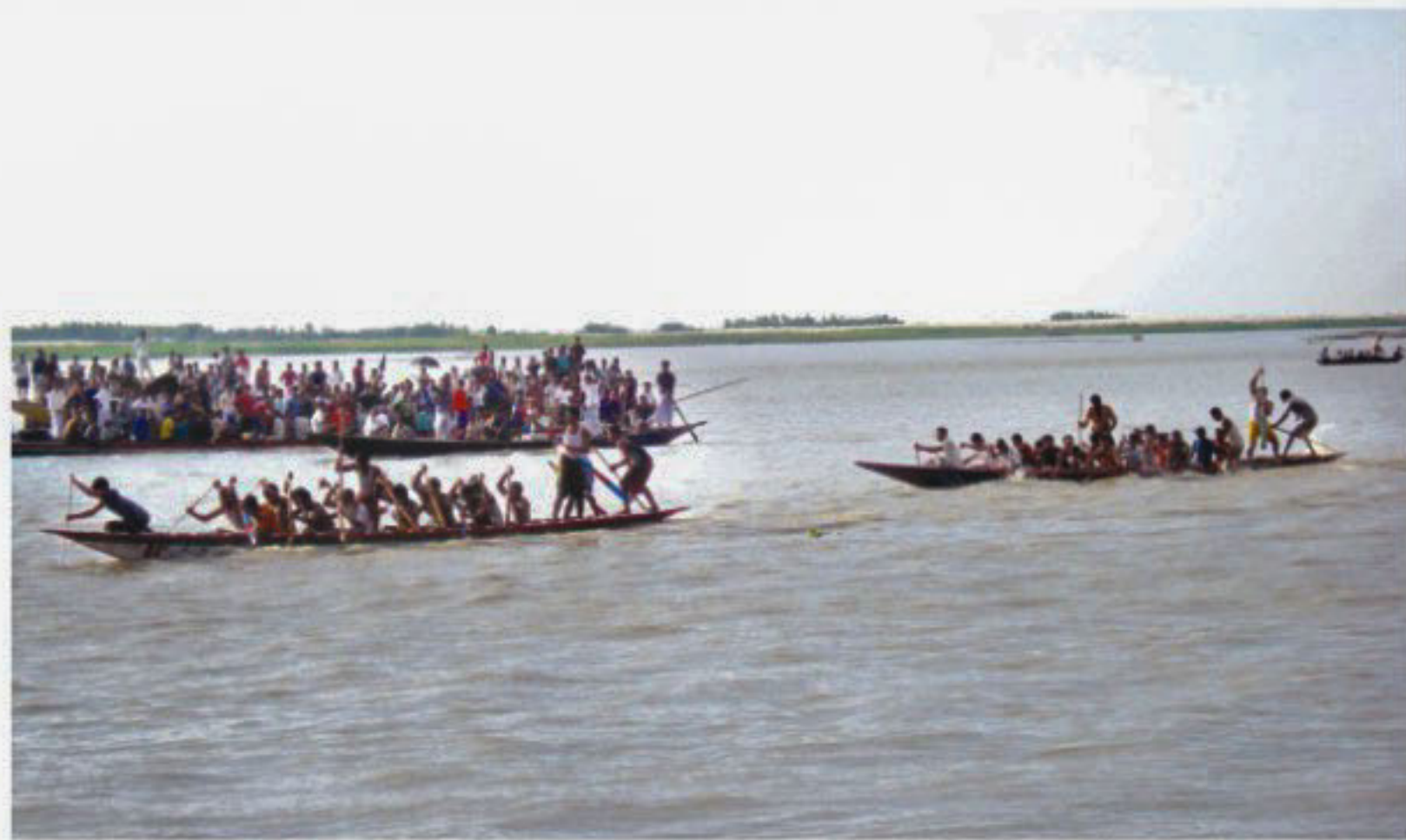
Thousands gathered on the banks of the Jamuna River to enjoy the traditional event.

upazila in Tangail was awarded the first prize in the event in the large boat category.