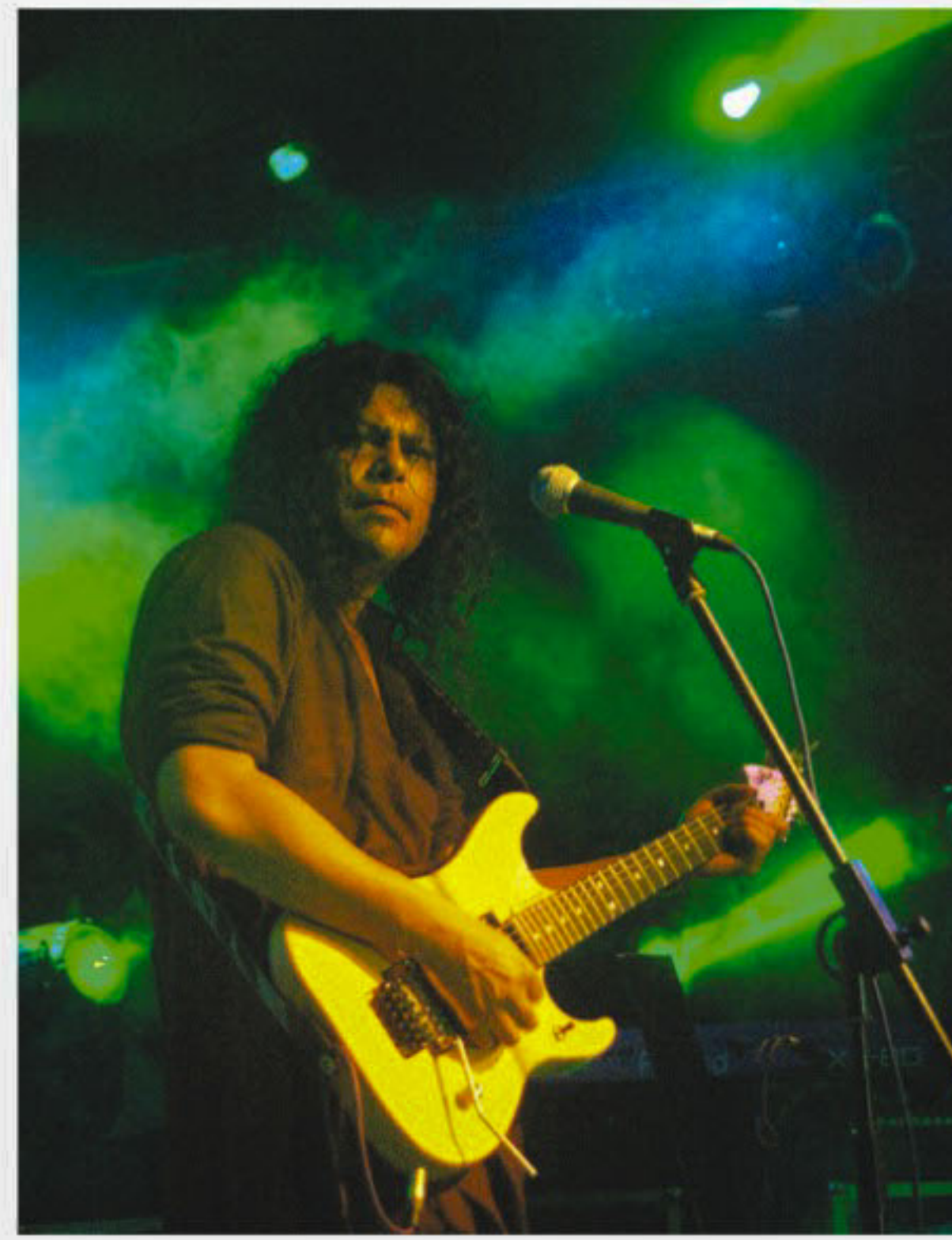
Concert for Sundarbans was held to create awareness and to collect votes for the largest mangrove forest to become one of the seven new natural wonders of the world.