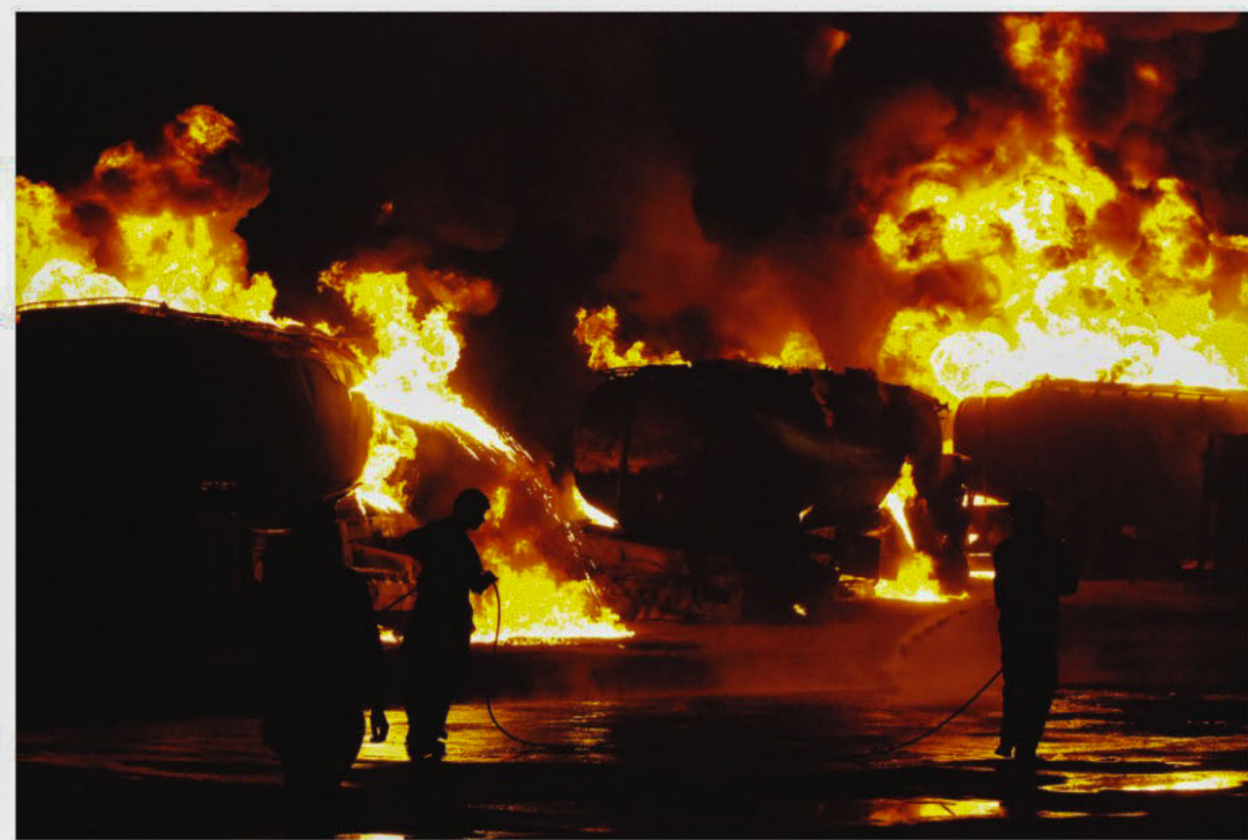
Trucks and tankers carrying supplies for Nato forces in Afghanistan burn following an attack by gunmen at Shikarpur in the southern Sindh province early yesterday. They torched more than two-dozen trucks and tankers.