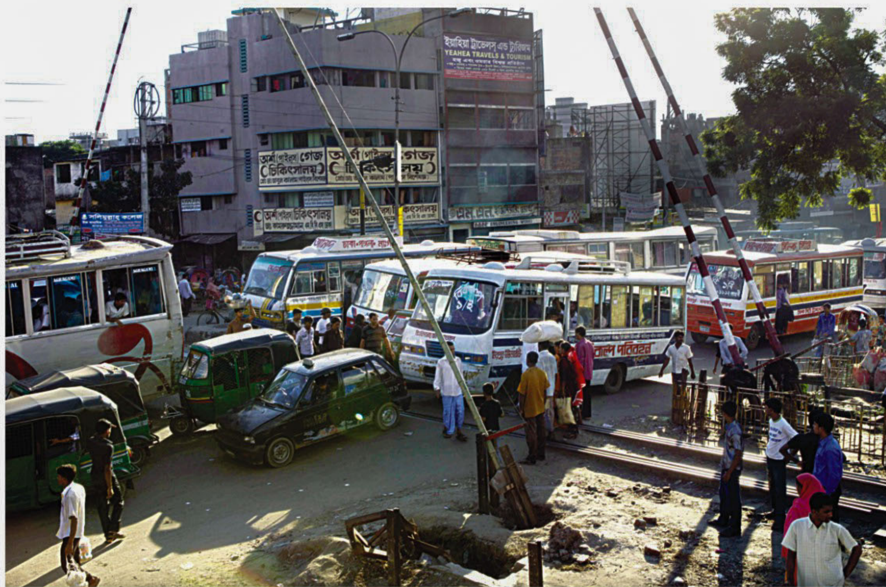
Heavy traffic passes through the Sayedabad level crossing in the capital where an accident left six people dead Wednesday. The government more than a year ago decided to build overpasses over some level crossings in Dhaka but there is almost no sign of progress in that direction.