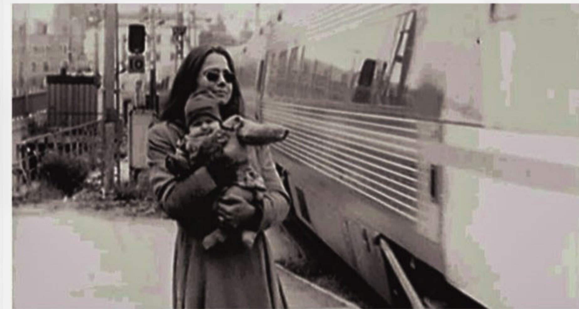
The festival will commence through screening of "Lumiere and Company".