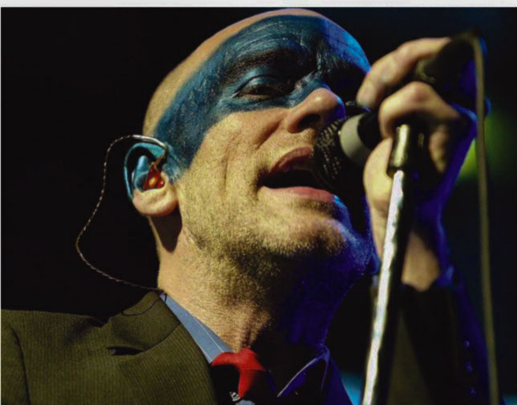
REM's "Everybody Hurts" tops the list.