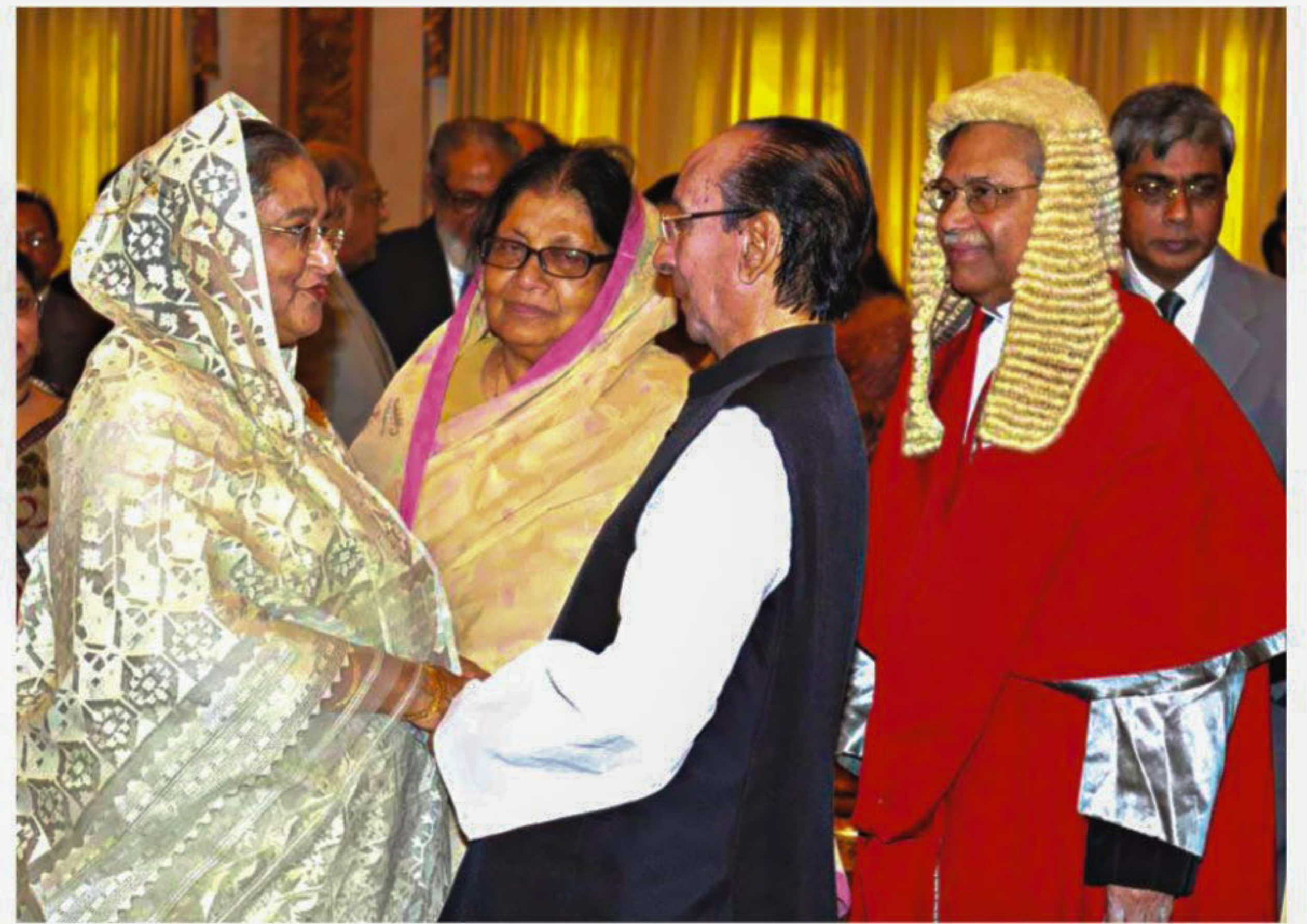
President Zillur Rahman talks to Prime Minister Sheikh Hasina right after administering oath to newly appointed Chief Justice ABM Khairul Haque at Bangabhaban yesterday morning.