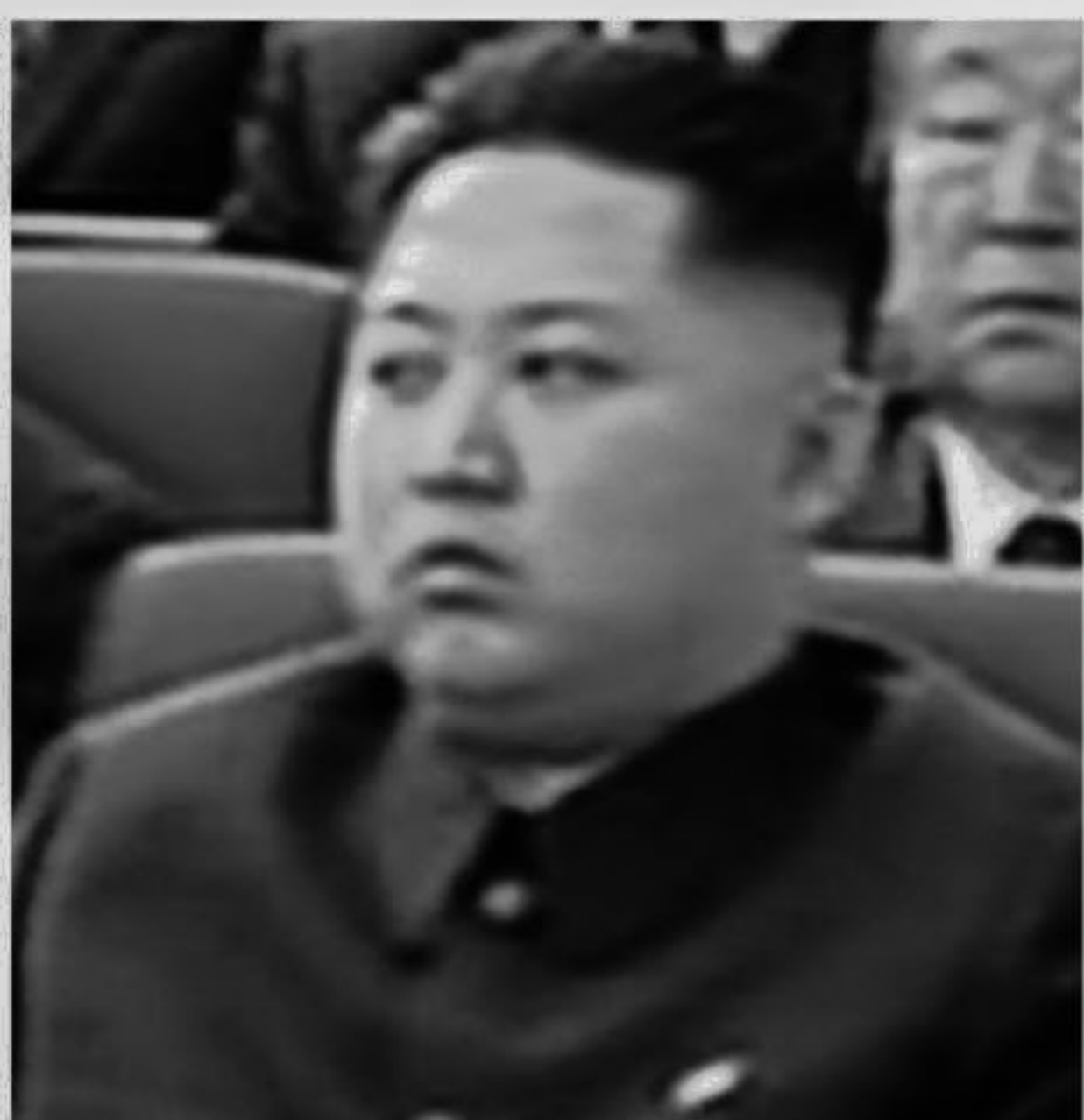
An image grab from state-run Korean Central Television (KCTV) broadcast on South Korean television yesterday shows whom experts believe is Kim Jong-Un, North Korean leader Kim Jong-il's youngest son and likely heir.

In a shock move three weeks ago, the 40-year-old sultan, who had been regent, was appointed new ruler in the culmination of months of palace intrigue.