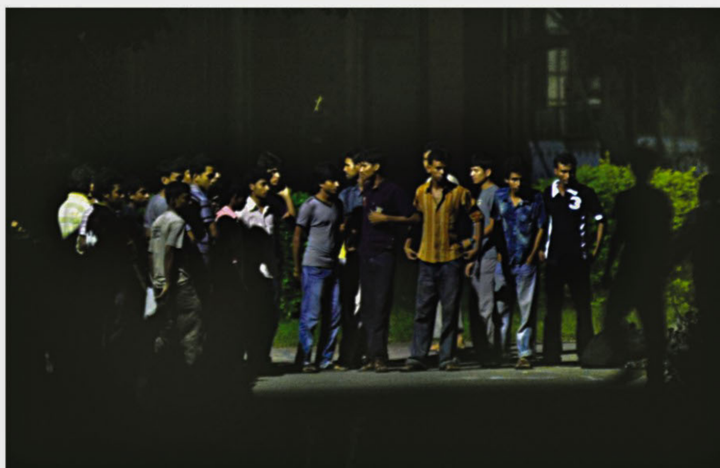
BCL activists kept first-year students of Shahidullah Hall of DU out in the open on Curzon Hall premises last night, as they did not join the PM's reception. The photo was taken today at 1:30am.