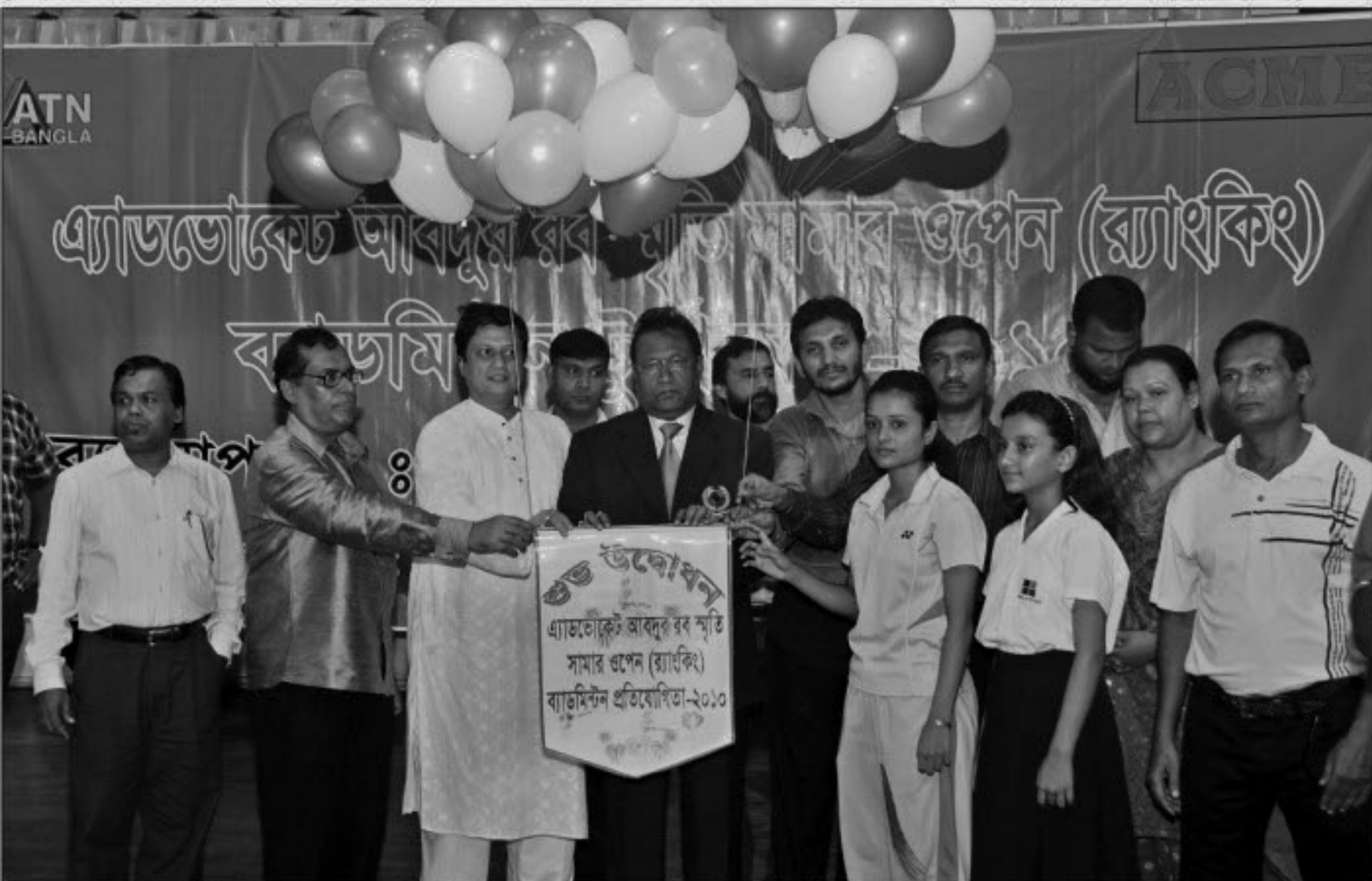
State Minister for Youth and Sports Ahad Ali Sarker (C) inaugurates the Advocate Abdur Rab Smriti Summer Open Badminton tournament at the Suhrawardi National Indoor Stadium in Mirpur yesterday.