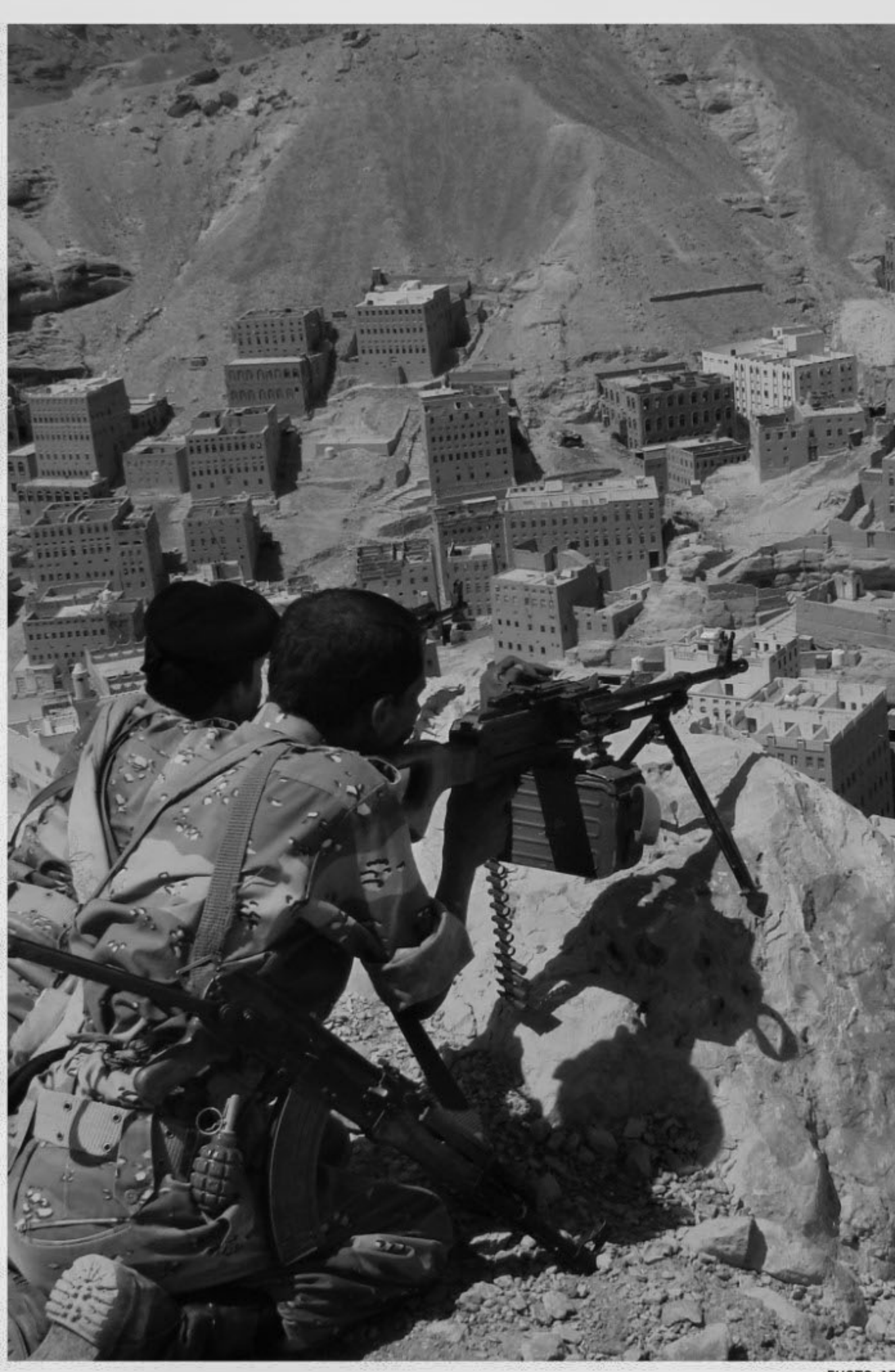
Yemeni army troops take position on Monday in the hills overlooking the southern town of Huta, three days after regaining control of the besieged town from suspected al-Qaeda militants who had been holed up in the Shabwa province area for a week in fighting that sparked a mass exodus of civilians.