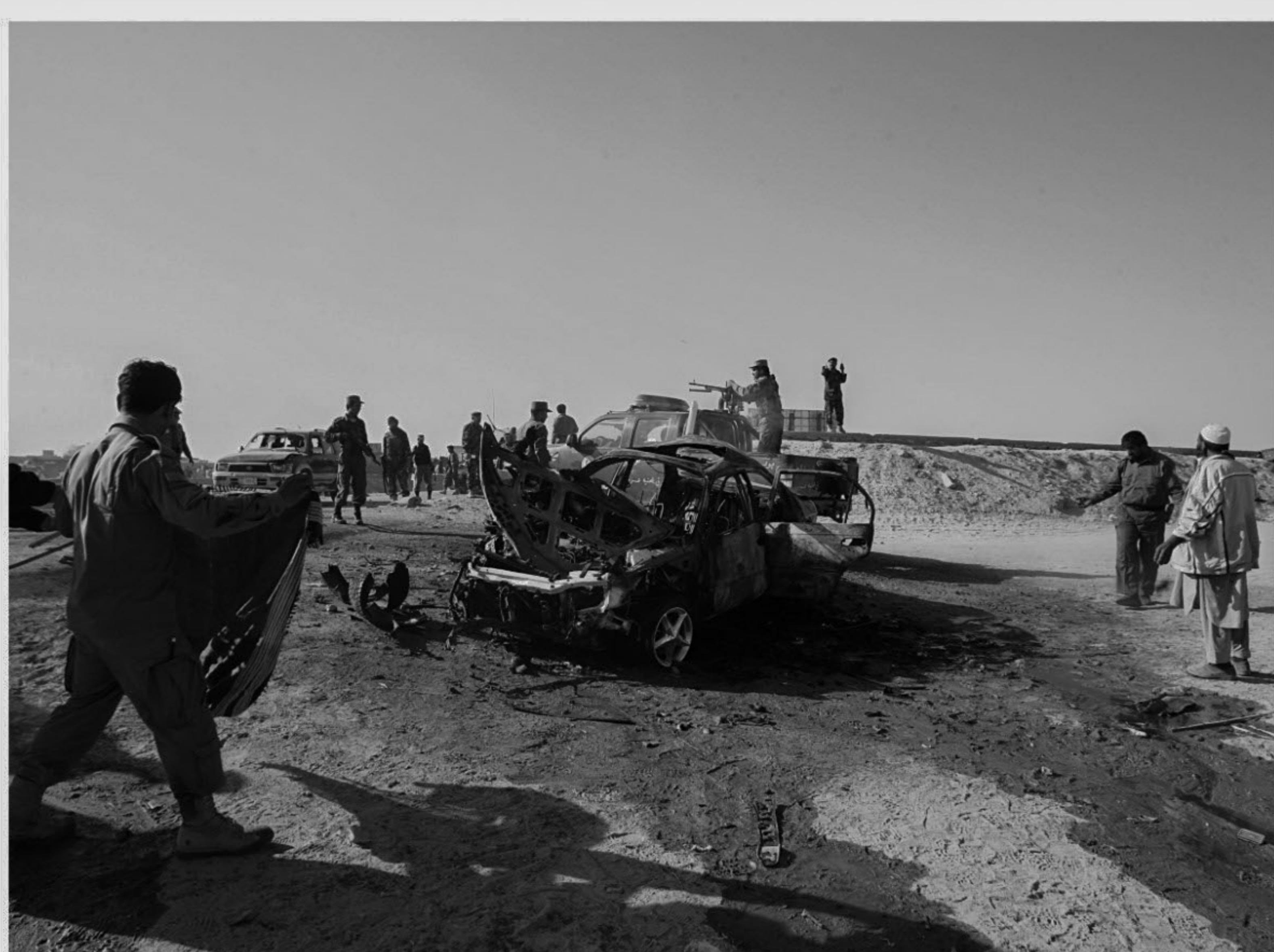
Afghan policemen stand guard at the site of a suicide attack in Ghazni province yesterday. A suicide attacker on an explosives-laden motorcycle killed a deputy Afghan governor and up to five other people in a direct attack on his vehicle, officials said.

The Home Ministry has identified 32 sensitive places across the country -- four of them in Uttar Pradesh -- where there is a potential to "evoke sharp reactions" following the verdict and asked states to be fully alert.