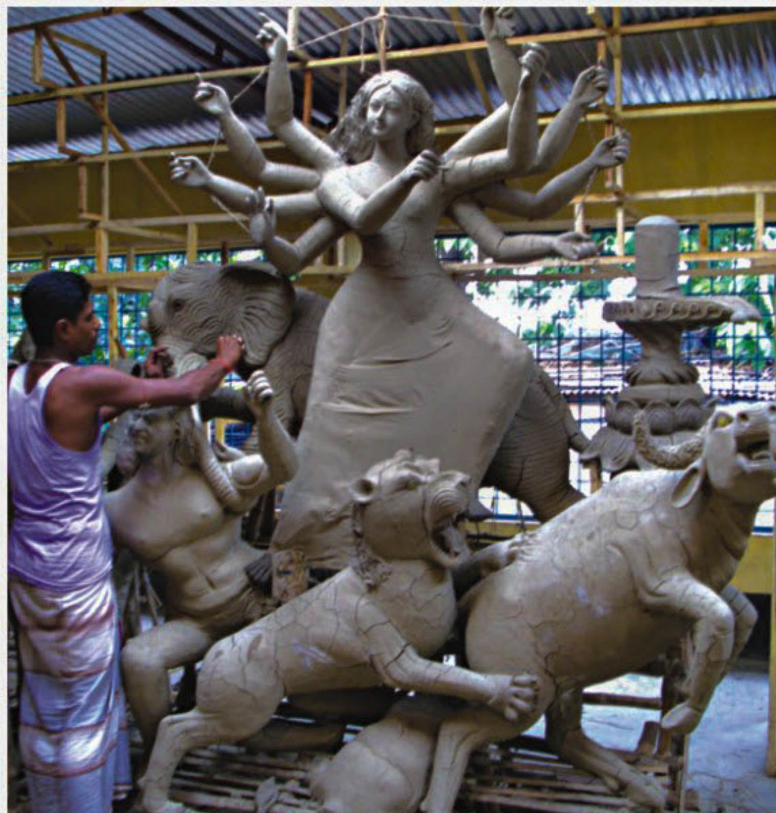
An artisan busy working on a Durga idol.