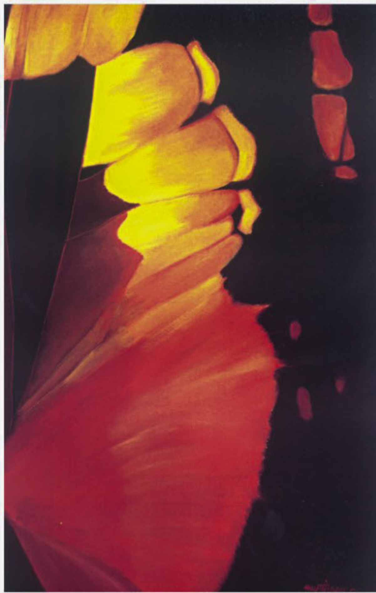
Clockwise (from top-left): The Wing-108, The Wing-99 and The Wing-128.