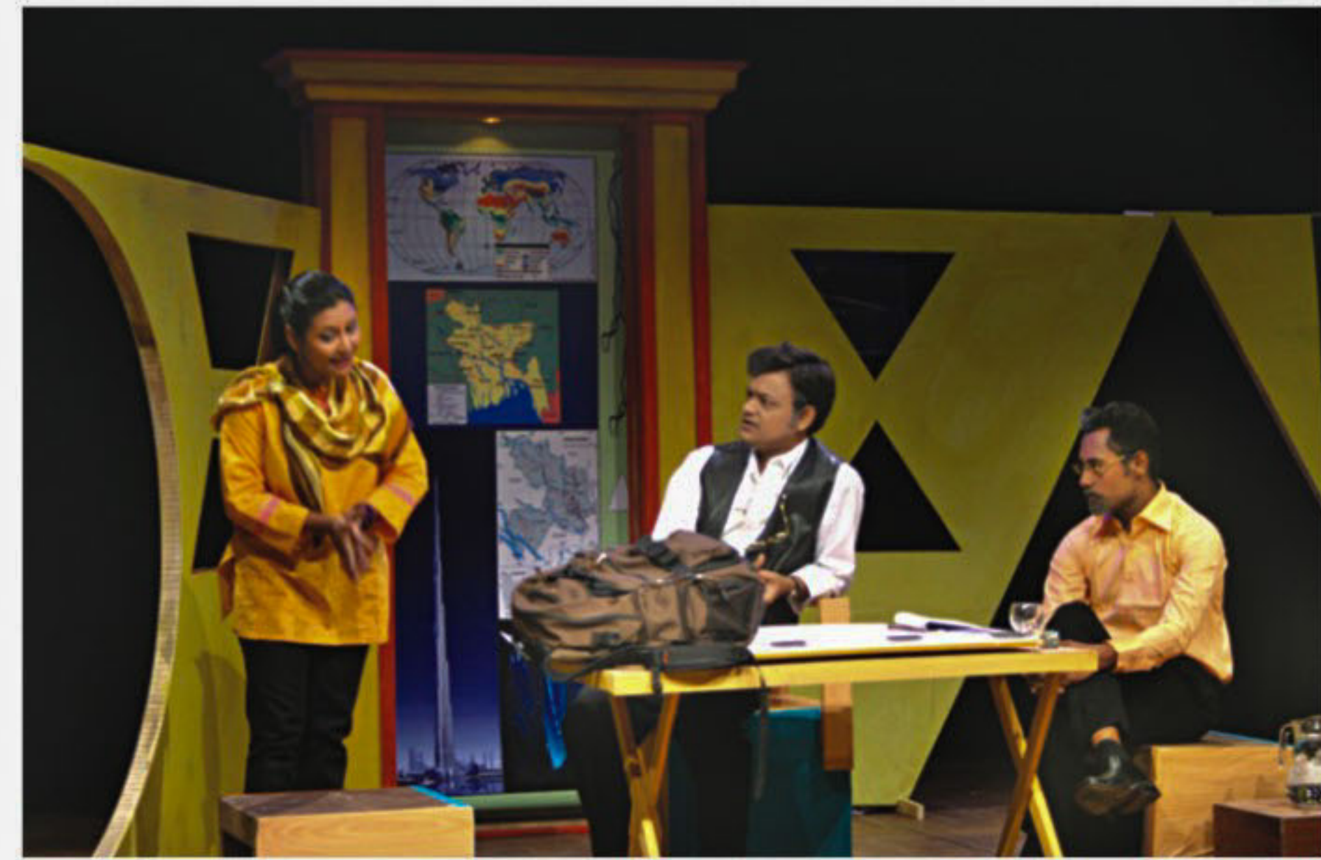
Actors of Bongorongo in "Gurunirmata".