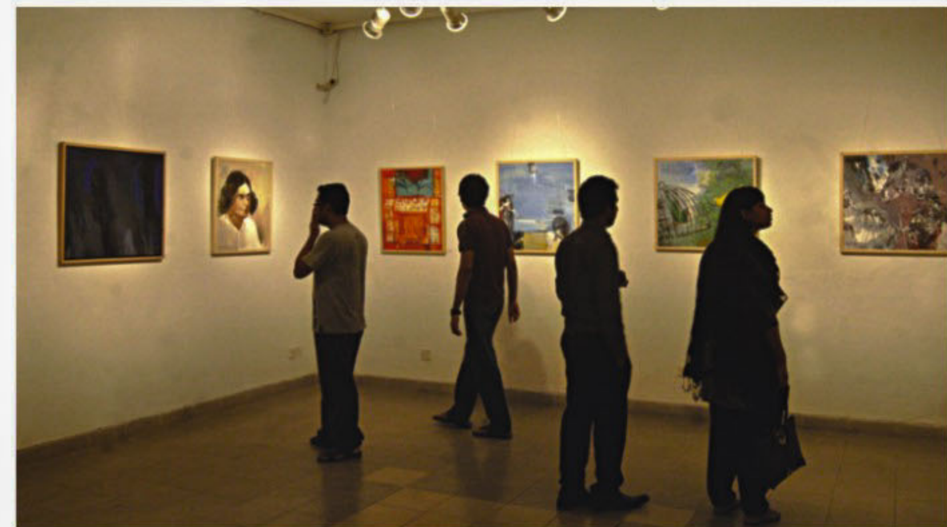
As part of the nine daylong cultural programmes marking 12th anniversary of Channel i, a painting exhibition -- featuring works of eminent artists -- along with a musical soiree was held at Bengal Gallery of Fine Arts in Dhanmondi, Dhaka. Noted folk singer Bari Siddiqui performed on the opening day (September 26) at the event.