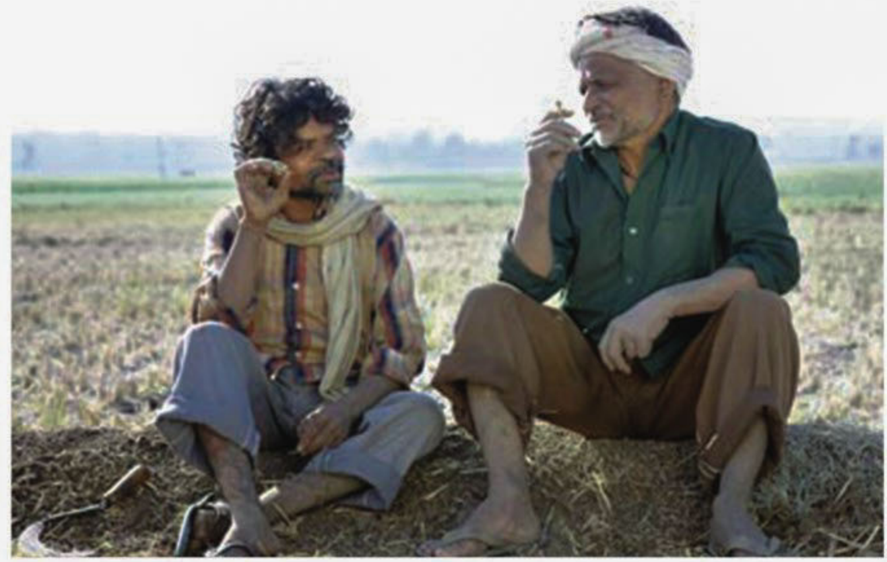
A scene from "Peepli [Live]".