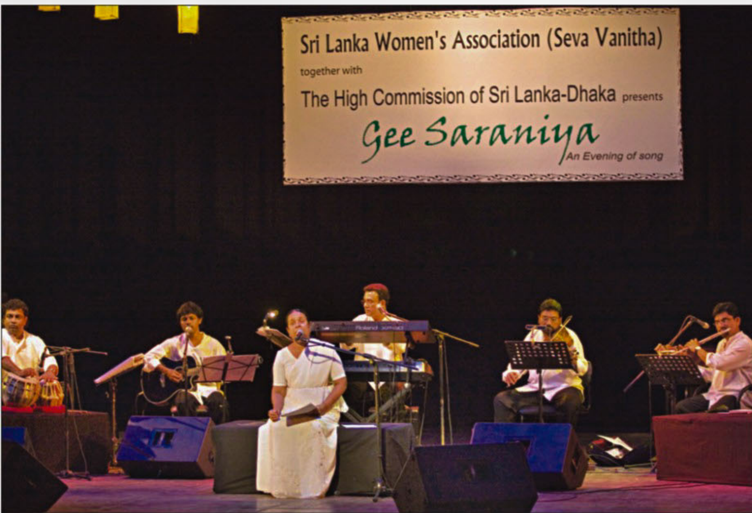
Nanda Malini (centre) is well known for her traditional style of singing.

Sri Lankan singer Nanda Malini performs at Shilpakala