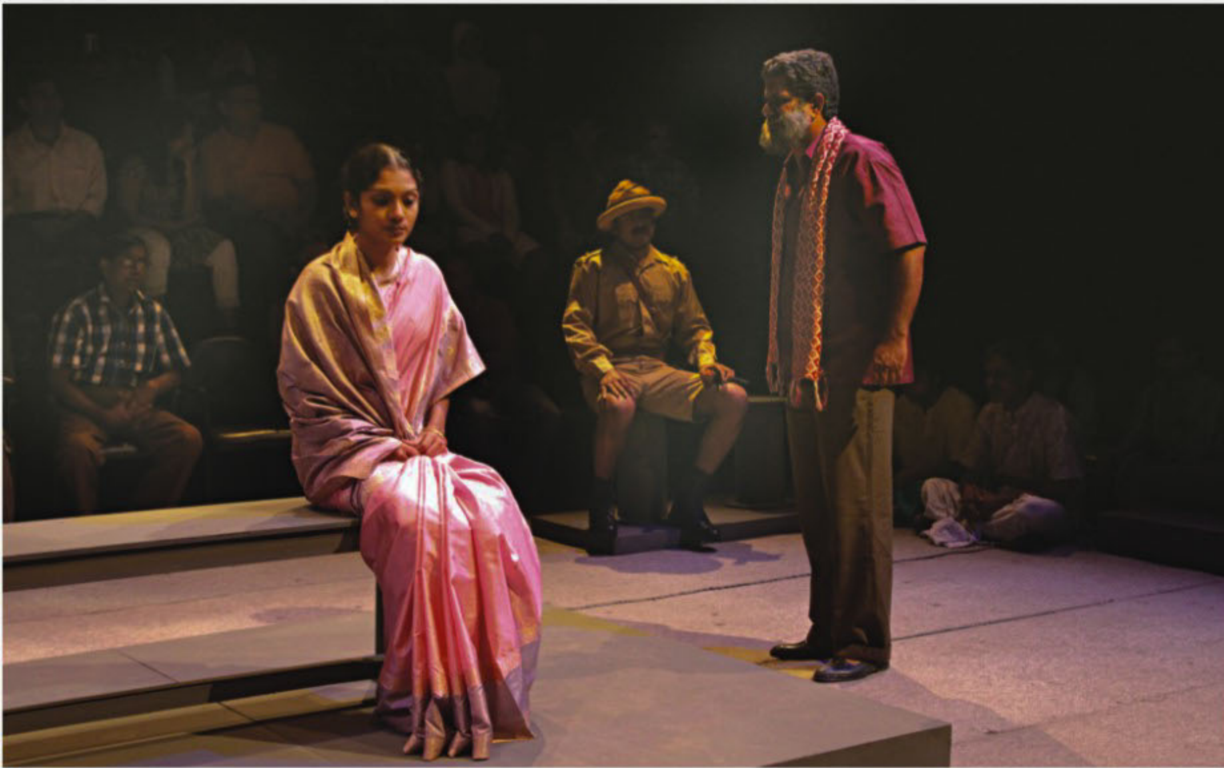
A scene from the play.

STAFF CORRESPONDENT Theatre (Arambagh) brings its 34th production "Jonmoshutro" onstage. The play premiered at the Experimental Theatre Hall, Bangladesh Shilpakala Academy, on September 24. "Jonmoshutro" is written