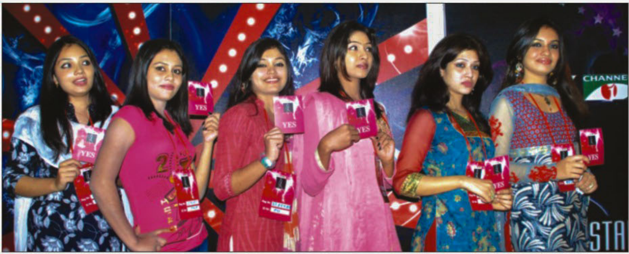
Six participants seen with "Yes" cards in the regional audition round of the talent hunt "Lux-Channel i Superstar 2010" in Bogra. Around 475 contestants participated in the event.