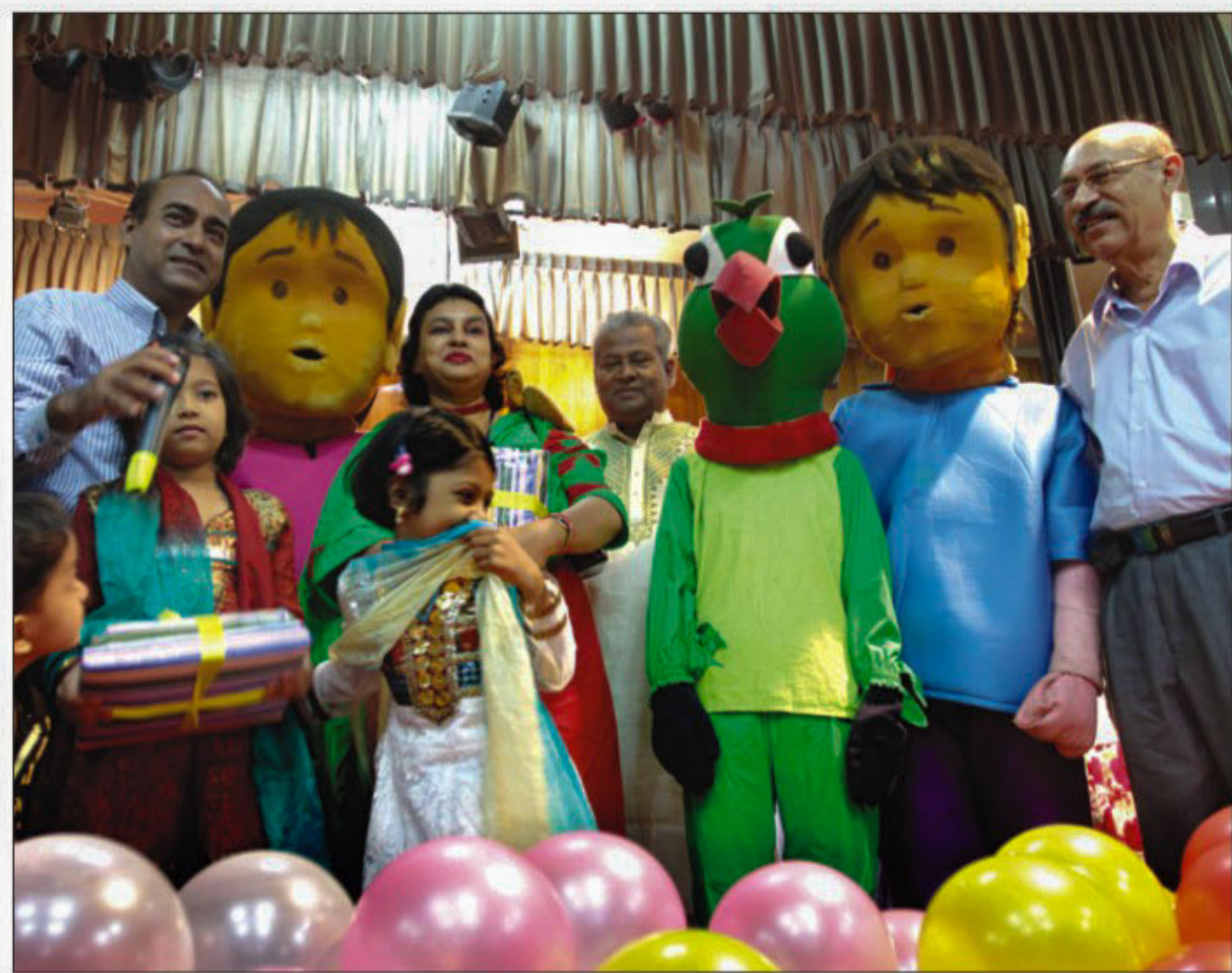
Guests pose for a photograph with the mascots of Mina, Raju and Mithu of the cartoon "Mina" at the LGED auditorium in the city yesterday on the occasion of the Mina Day organised by Directorate of Primary Education.

Cultural personalities Abul Hayat and Mamunur Rashid also spoke on the occasion.