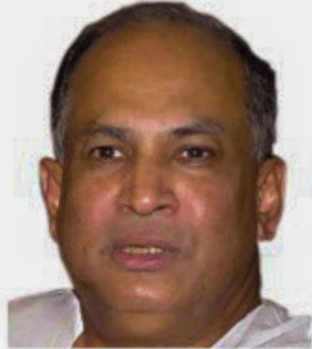
SQ Chowdhury measure.