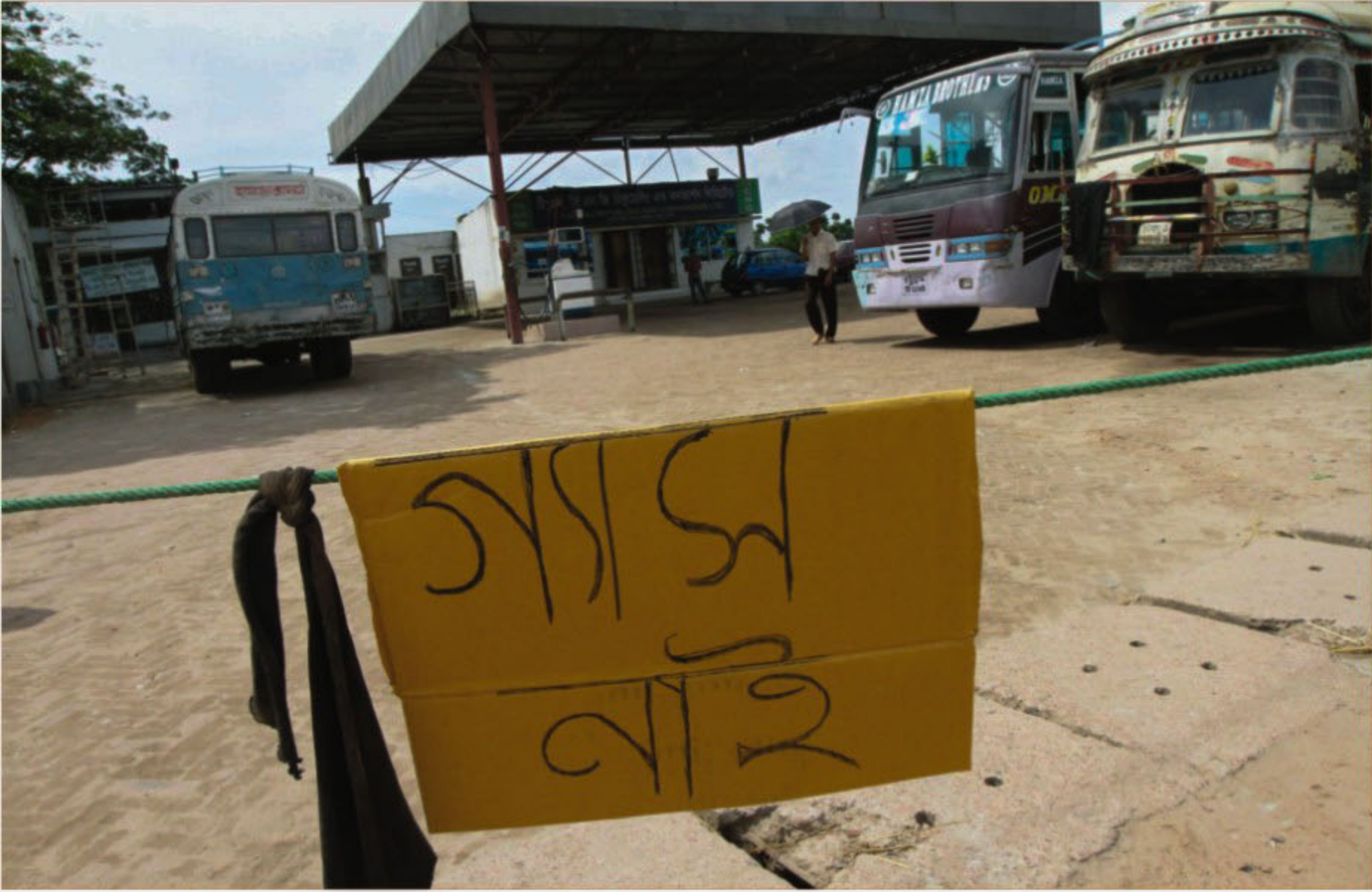
A CNG refilling station at Ashulia hangs a notice that reads in Bangla: No Gas Available. Many CNG stations in Savar and Ashulia are about to shut because of gas crisis. The photo was taken a few days ago.