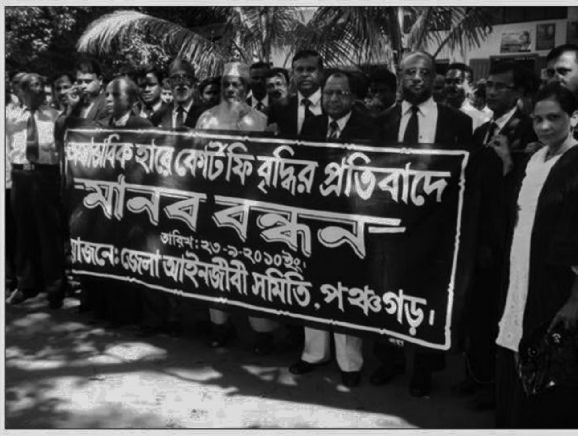
Panchagarh lawyers yesterday organised a human chain on the town's judge court premises protesting 'unusual' hike of court fees from September 1.