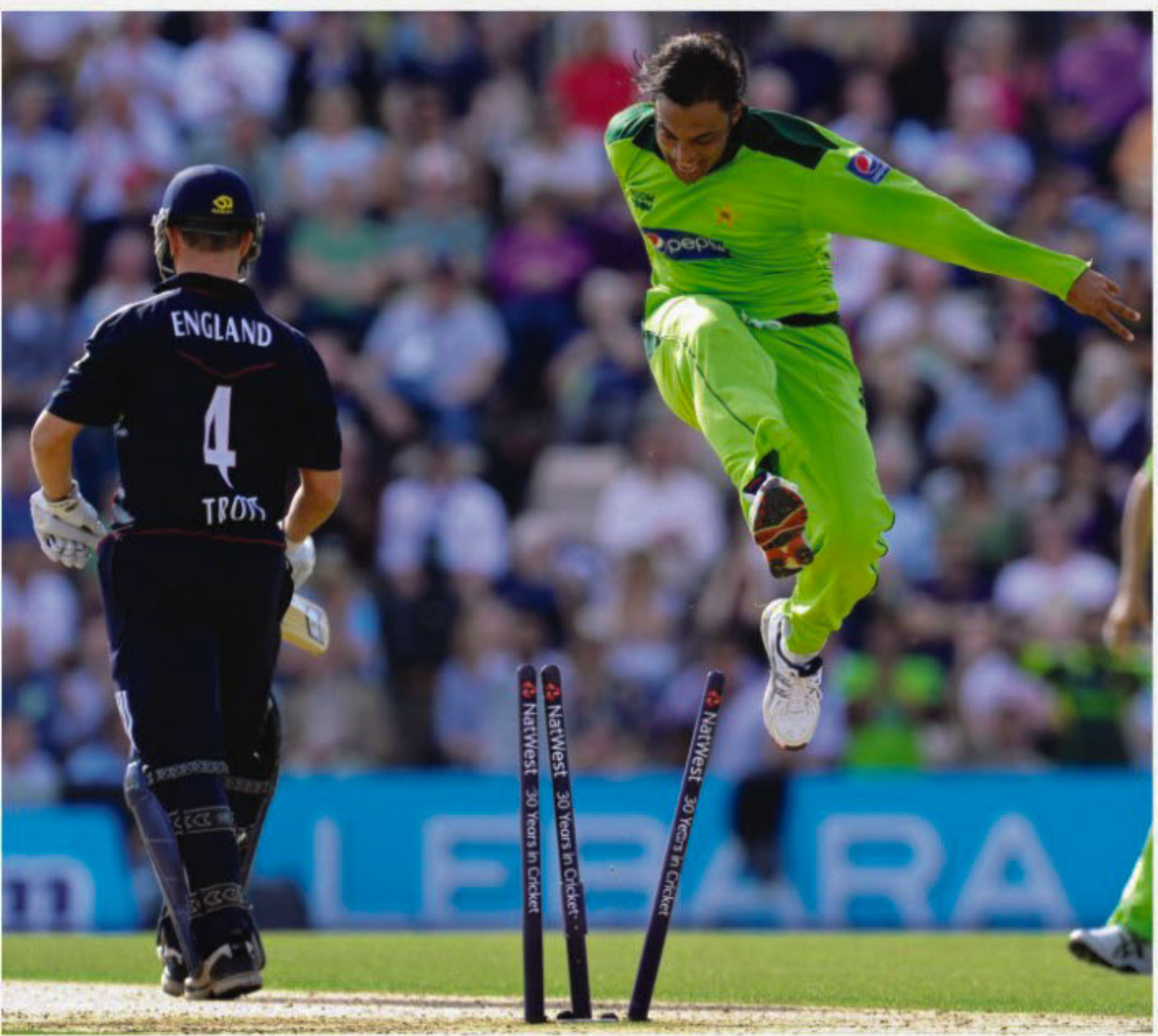
Pakistan fast bowler Shoaib Akhtar jumps for joy after taking the wicket of England's Jonathan Trott during the fifth ODI at Rose Bowl yesterday. After 43 overs, England were 191 for 4.