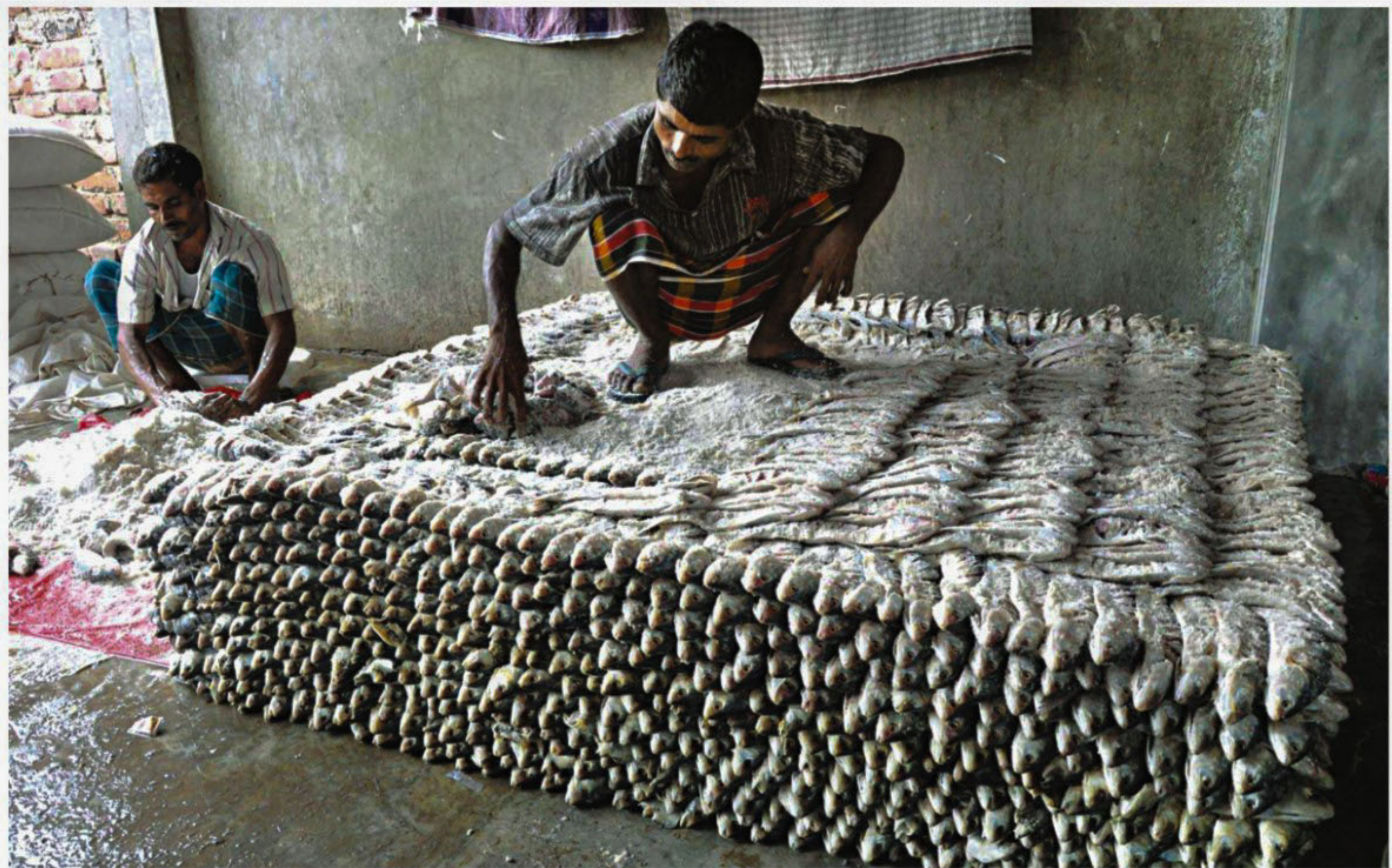
Despite good hilsa catch in the Bay, prices soar in the market. The demand for fresh hilsa and dried hilsa continues to increase. This photo taken at Firingibazar of Chittagong shows people spreading salt on a neatly formed pile of the fish for preservation.

Some Bangladeshi fishermen also work in the Maldives, he added.