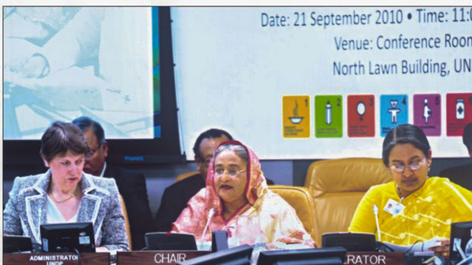
Prime Minister Sheikh Hasina speaks at a meeting of South Asian leaders on risks related to climate change and its effects on the Millennium Development Goals in New York on September 21. The prime minister presided over the meeting.