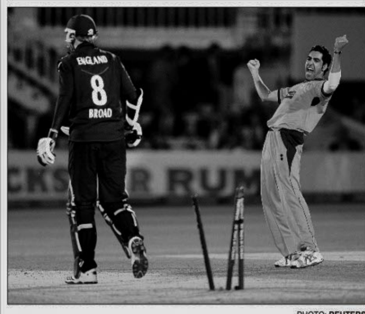
Pakistan paceman Umar Gul is exultant at the dismissal of last England batsman Stuart Broad in the fourth one-day international at Lord's on Monday.

Imran stressed Pakistan cricket "has to put its house in order" adding that, "there should no longer be a PCB chairman nominated by President of Pakistan who is not accountable to anyone."