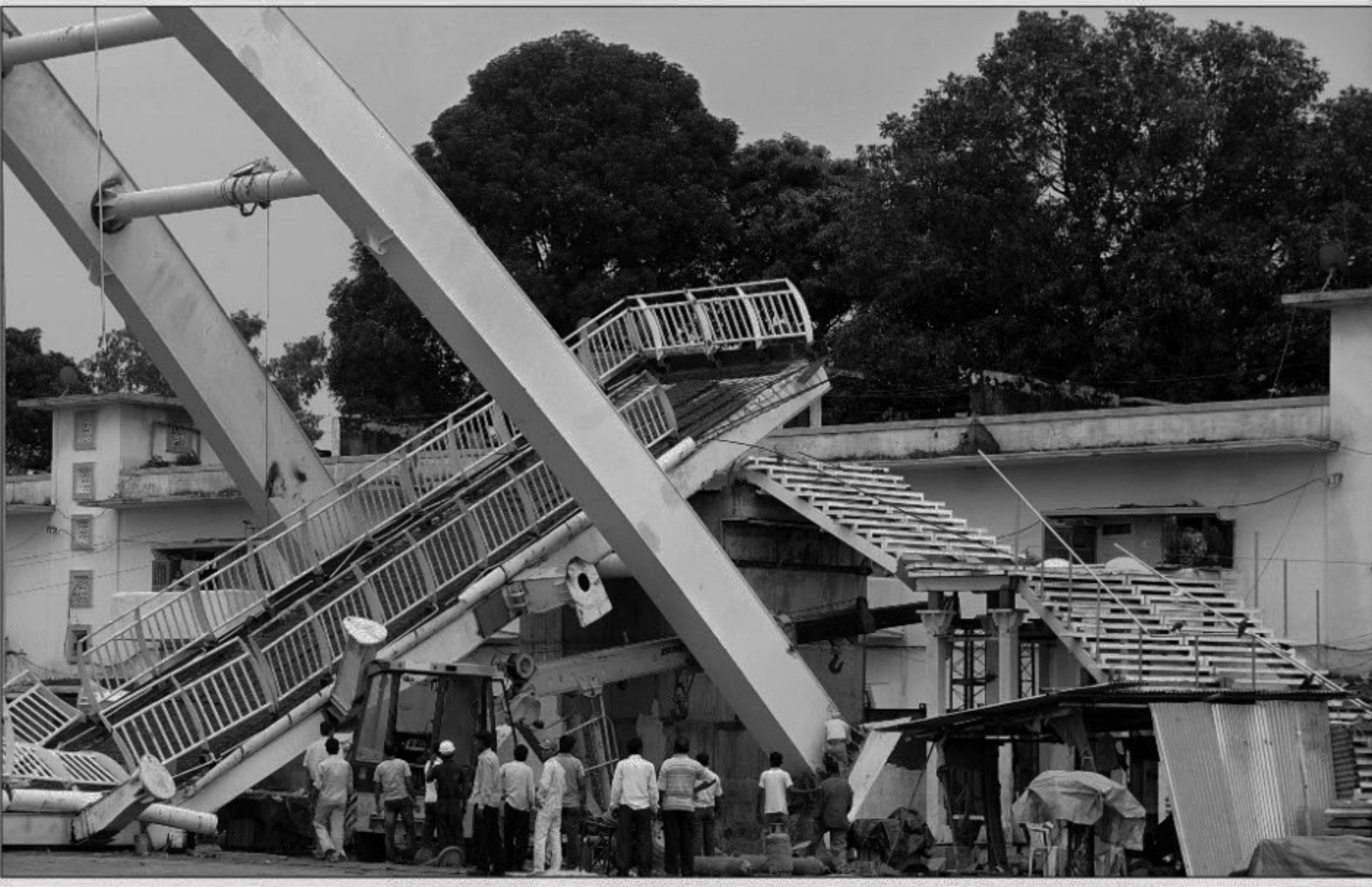
Workers gather at the scene of a collapsed footbridge at the Jawaharlal Nehru Stadium, the main venue for the forthcoming Commonwealth Games, in New Delhi yesterday.