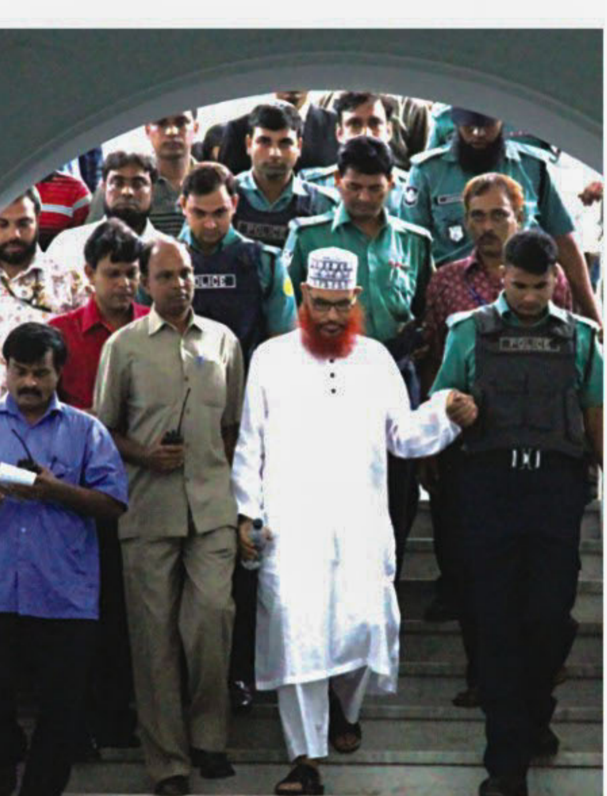
Jamaat Nayeb-e-Amir Delwar Hossain Sayedee is leaving the war crime tribunal after yesterday's session amid strict security.

STAFF CORRESPONDENT The UK Border Agency arrested ten Bangladeshi expatriates under a special law enforcement operation aimed at reducing illegal immigration, said a press release of the British High Commission in Dhaka yesterday. They were detained during August 19 to mid-September for working illegally in the UK and for committing other immigration offences. Steps are being taken to deport them, said the press release. The businesses will be penalised up to £100,000 or an estimated Tk10,700,000 for employing the illegal immigrants, unless they can prove they had carried out the SEE PAGE 15 COL 7