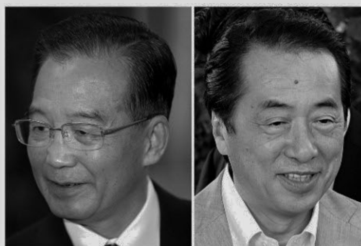
L-R: Chinese Premier Wen Jiabao and Japanese PM Naoto Kan

"How bad relations get now partly depends on how long the boat captain is detained,"