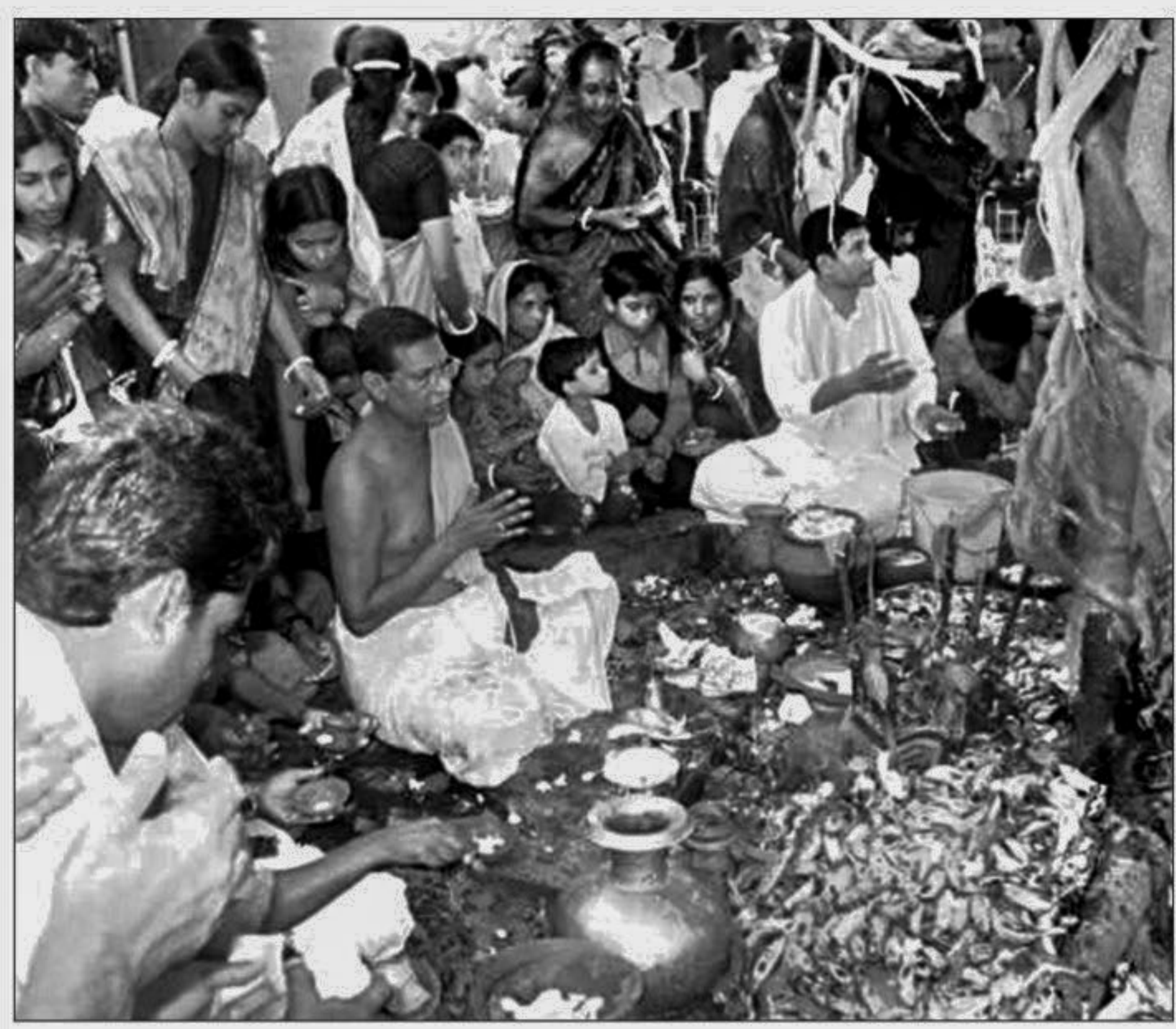
Hindu devotees worship goddess Manasha at Manasha tala on the bank of 'Gur Pukur' in Satkhira town where a fair began on Friday.