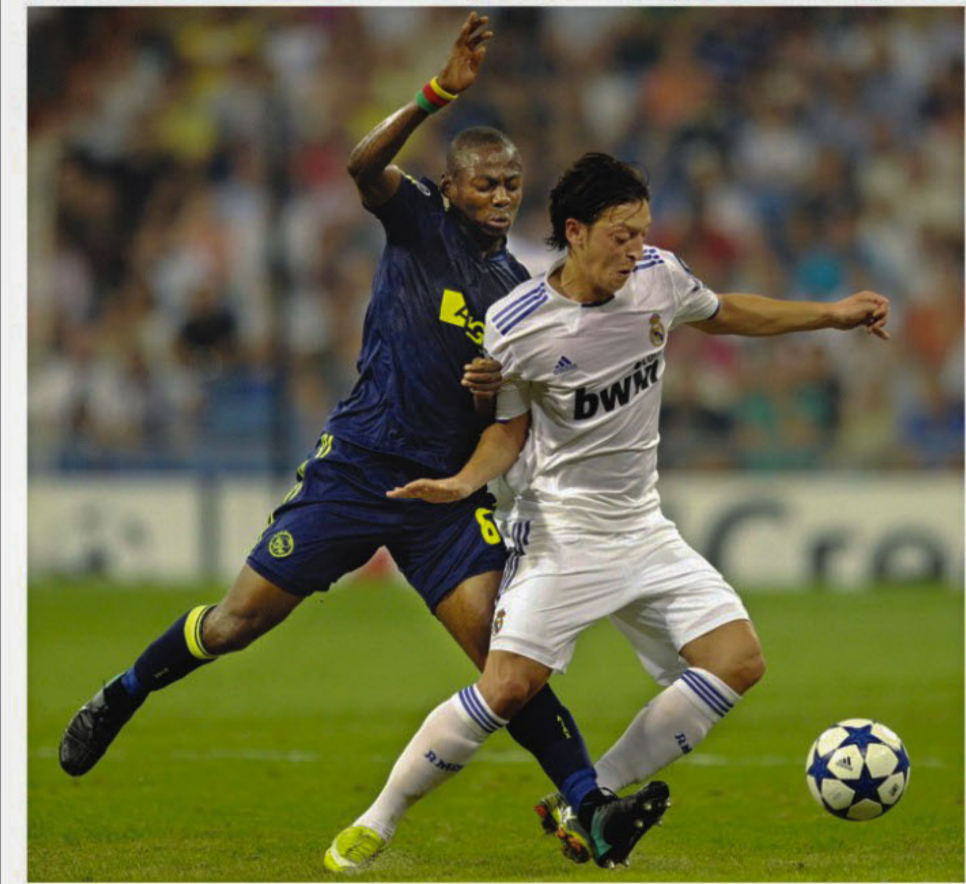
Real Madrid's Mesut Ozil (R) shrugs off Ajax's Eyong Enoh during their Champions League encounter at Santiago Bernabeu on Wednesday.