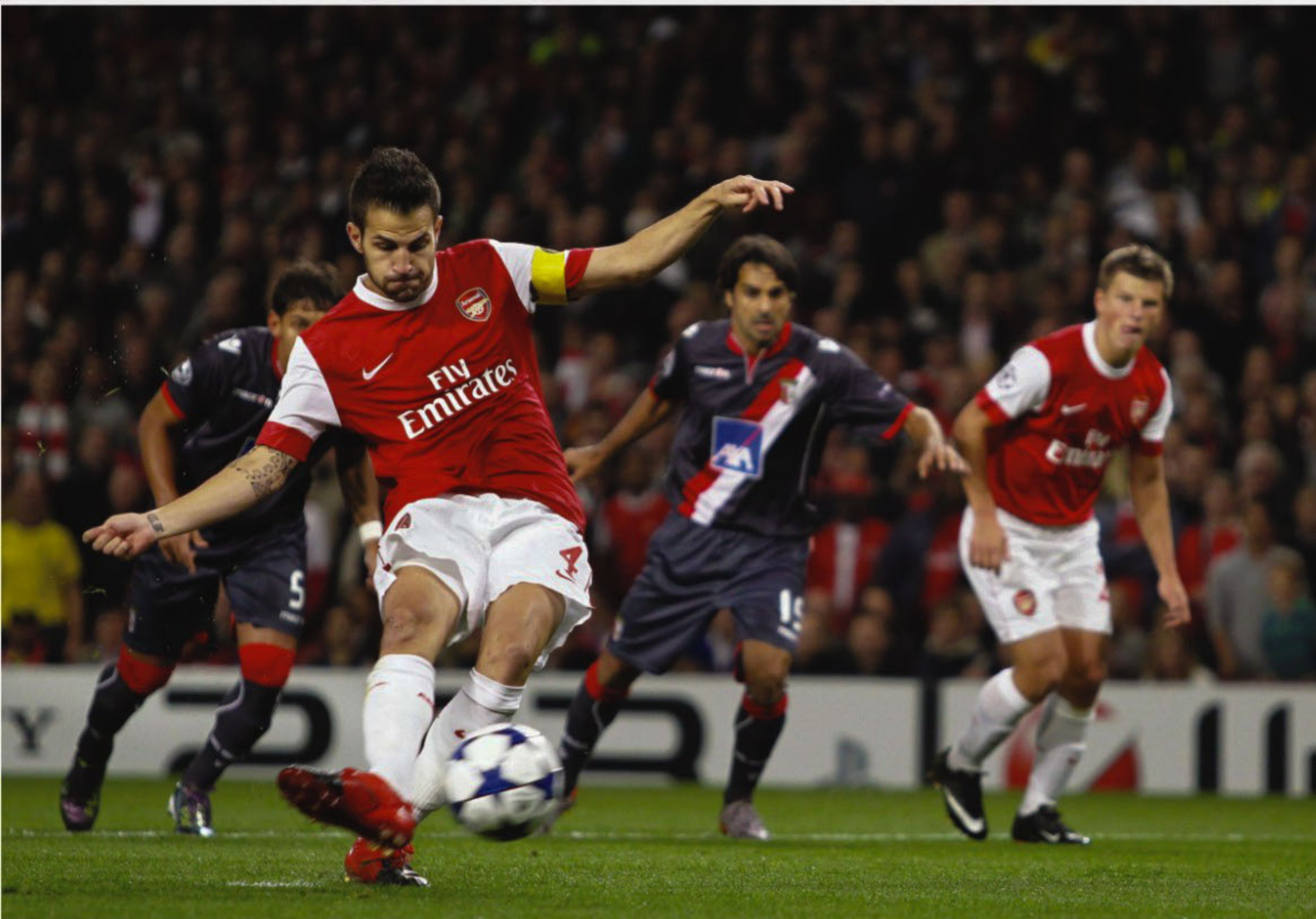
Arsenal's Cesc Fabregas scores the opening goal from a penalty against Braga during their Champions League tie at the Emirates Stadium on Wednesday.