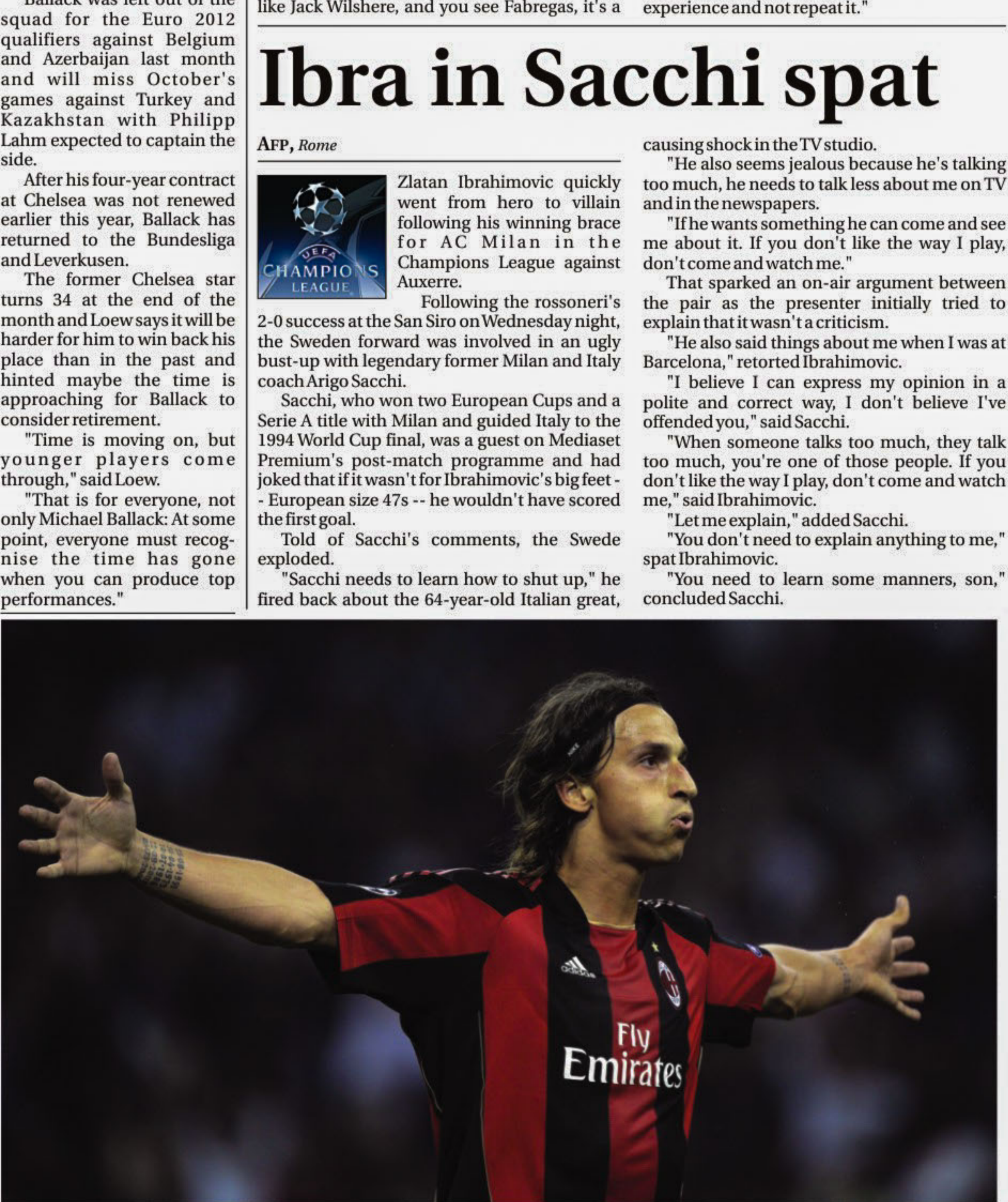
Milan striker Zlatan Ibrahimovic celebrates one of his two goals against Auxerre during their Champions League clash at San Siro on Wednesday.

"You need to learn some manners, son," concluded Sacchi.