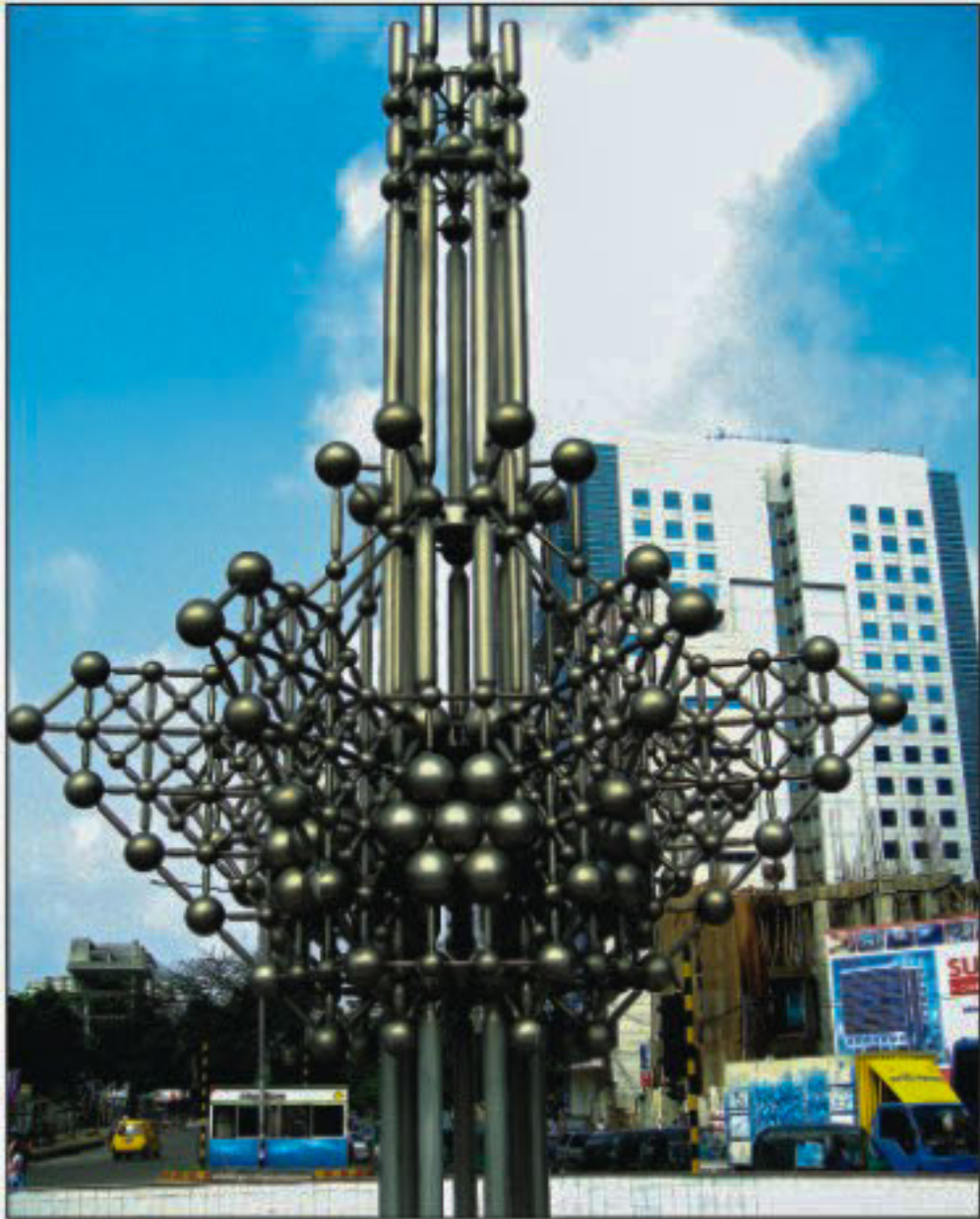
SAARC Fountain designed by the artist.