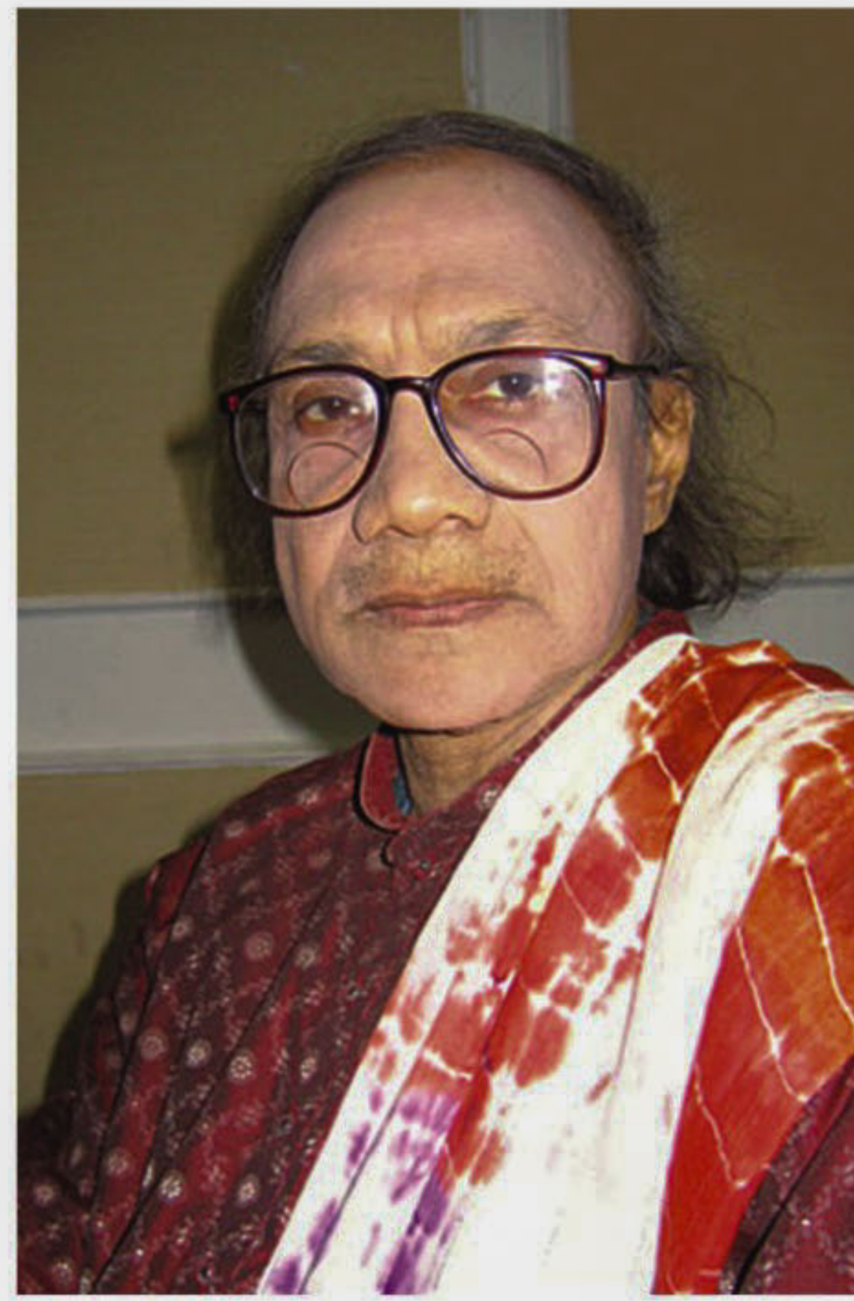
Abdul Mannan Syed

Syed started writing poems in 1960. His first book of poetry was published in 1967. Throughout a career spanning over five decades, he had written numerous poems and published over 60 books.