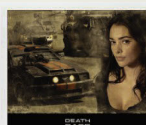
Death Race On HBO at 09:30pm Genre: Action/Thriller Cast: Jason Statham, Joan Allen