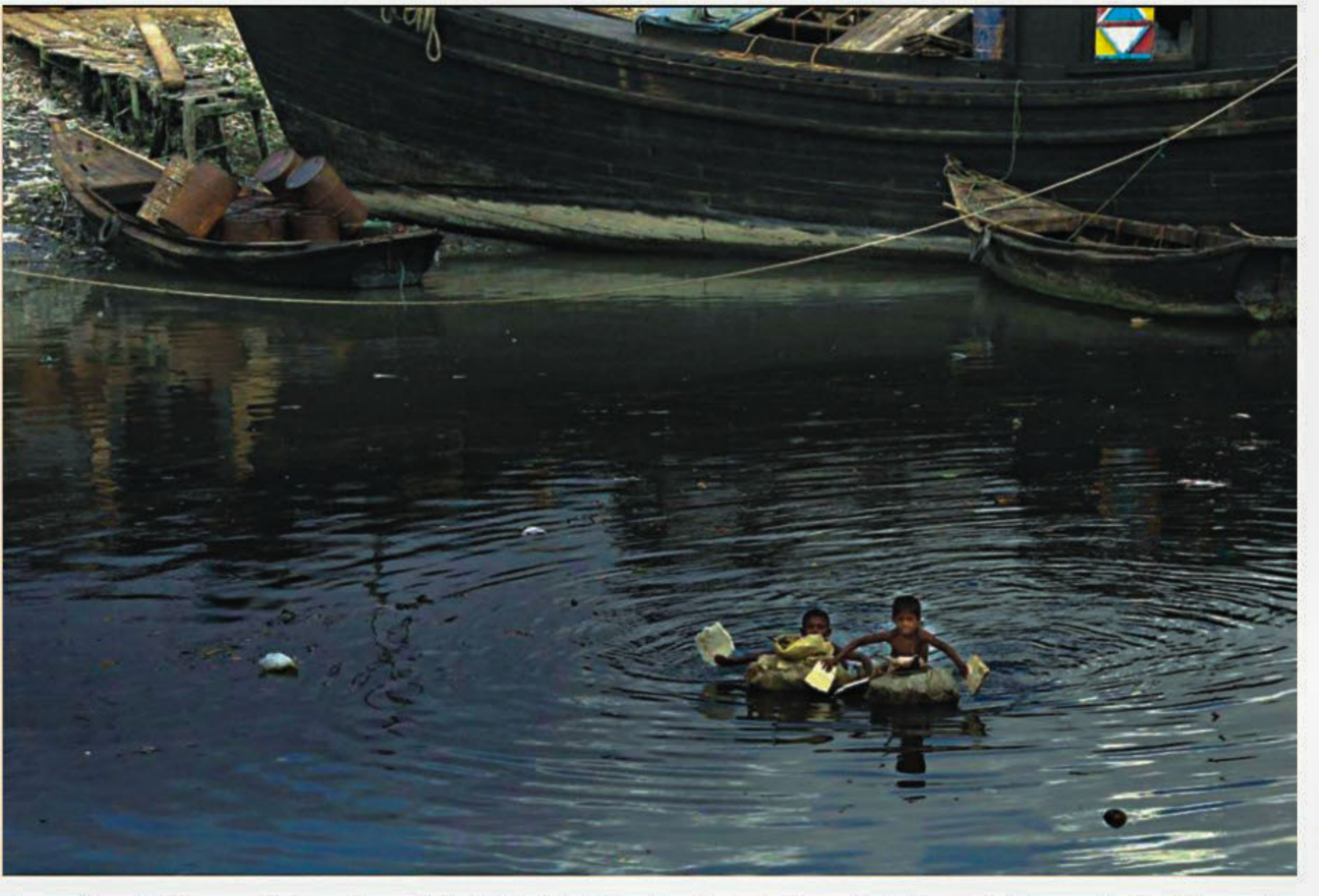
Sewage from Chittagong city flows through Chaktai Rajakhali Canal and into the Karnaphuli. The photo taken yesterday at the confluence of the canal and the Karnaphuli shows children playing in the dark thick polluted water.