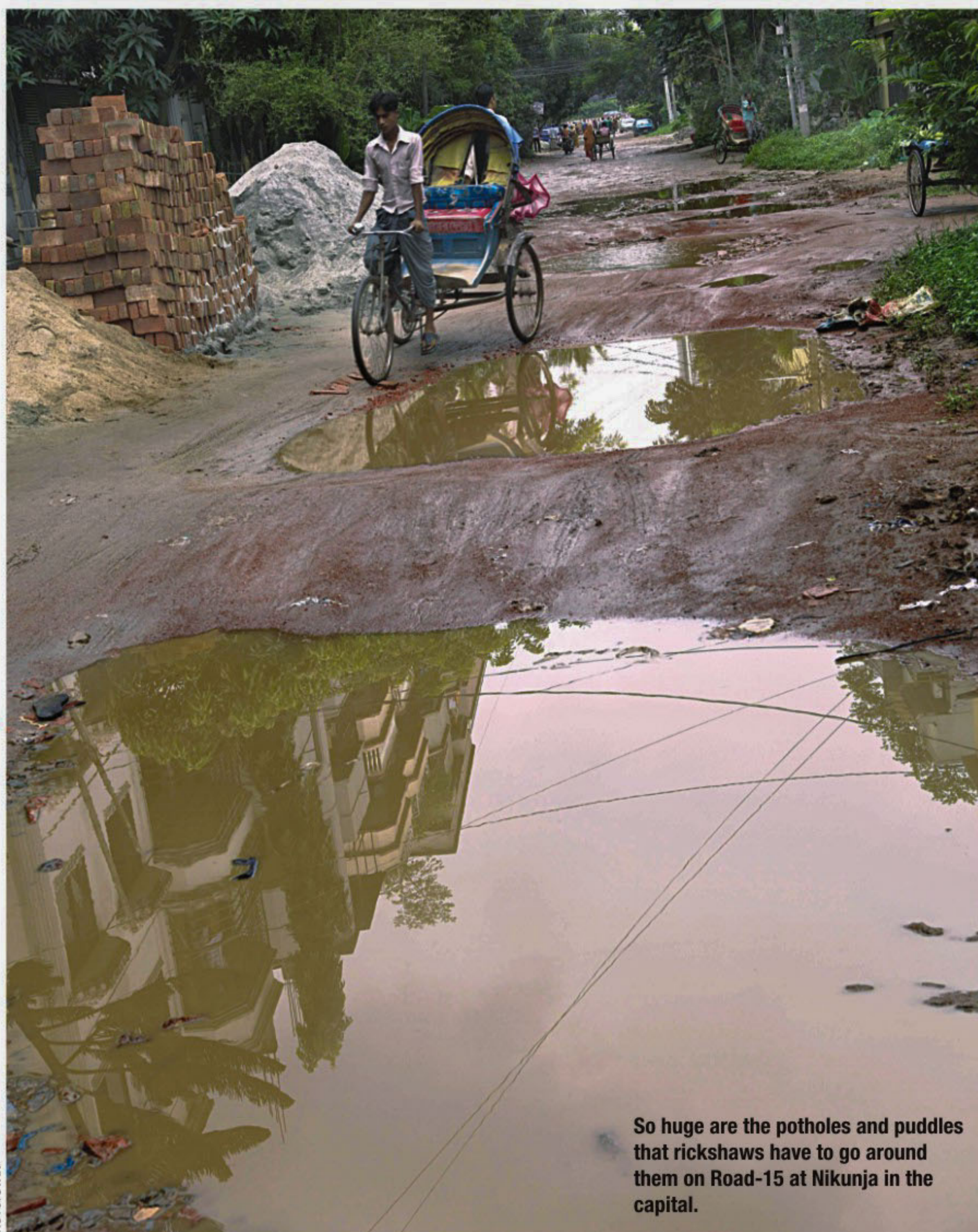
So huge are the potholes and puddles that rickshaws have to go around them on Road-15 at Nikunja in the capital.