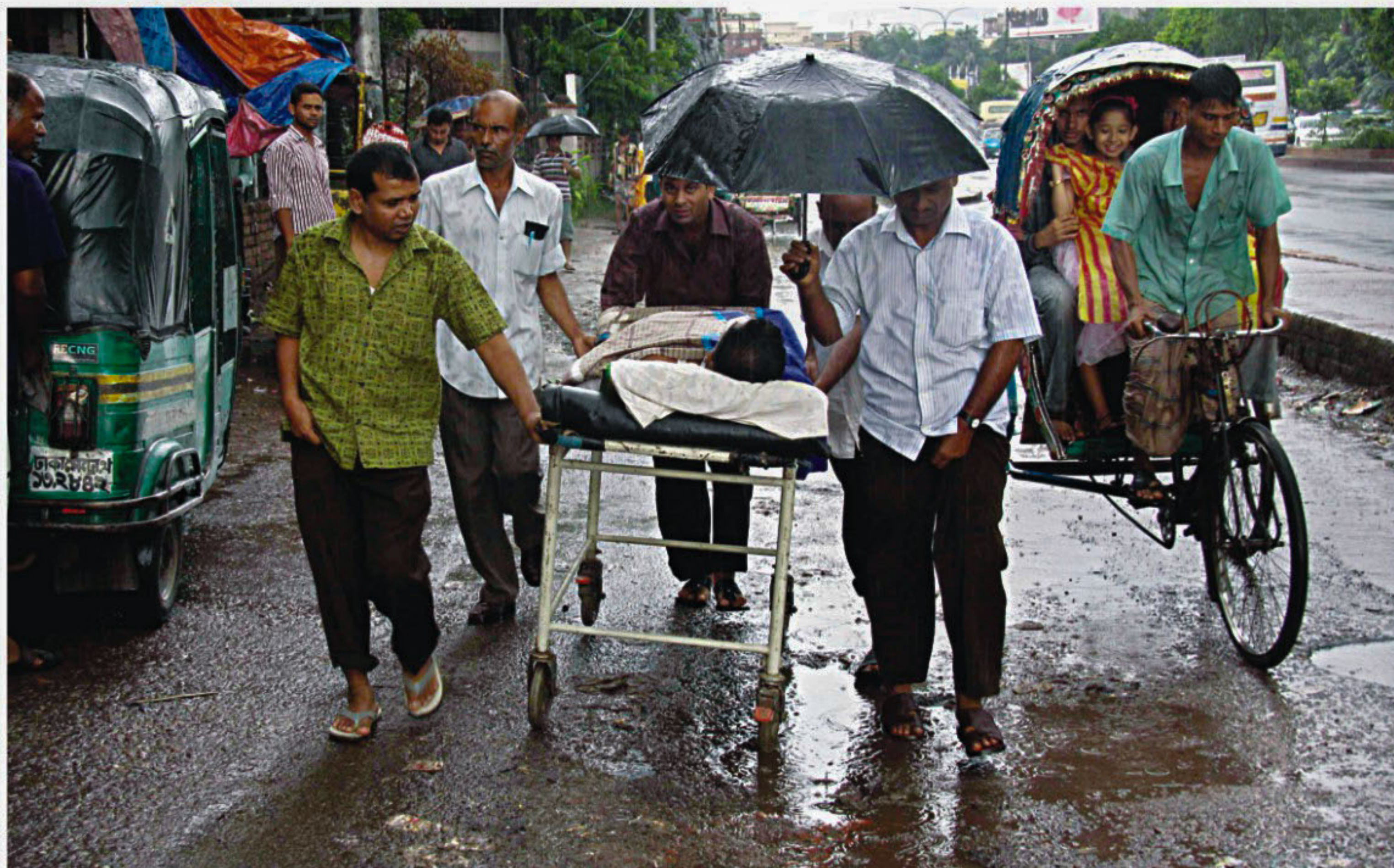
As many ambulance drivers are still on their extended Eid holidays, this patient had to be taken to a diagnostic centre two kilometres away from his clinic in Mohammadpur on a stretcher in pouring rain. The photo was taken yesterday afternoon near Suhrawardy Hospital.