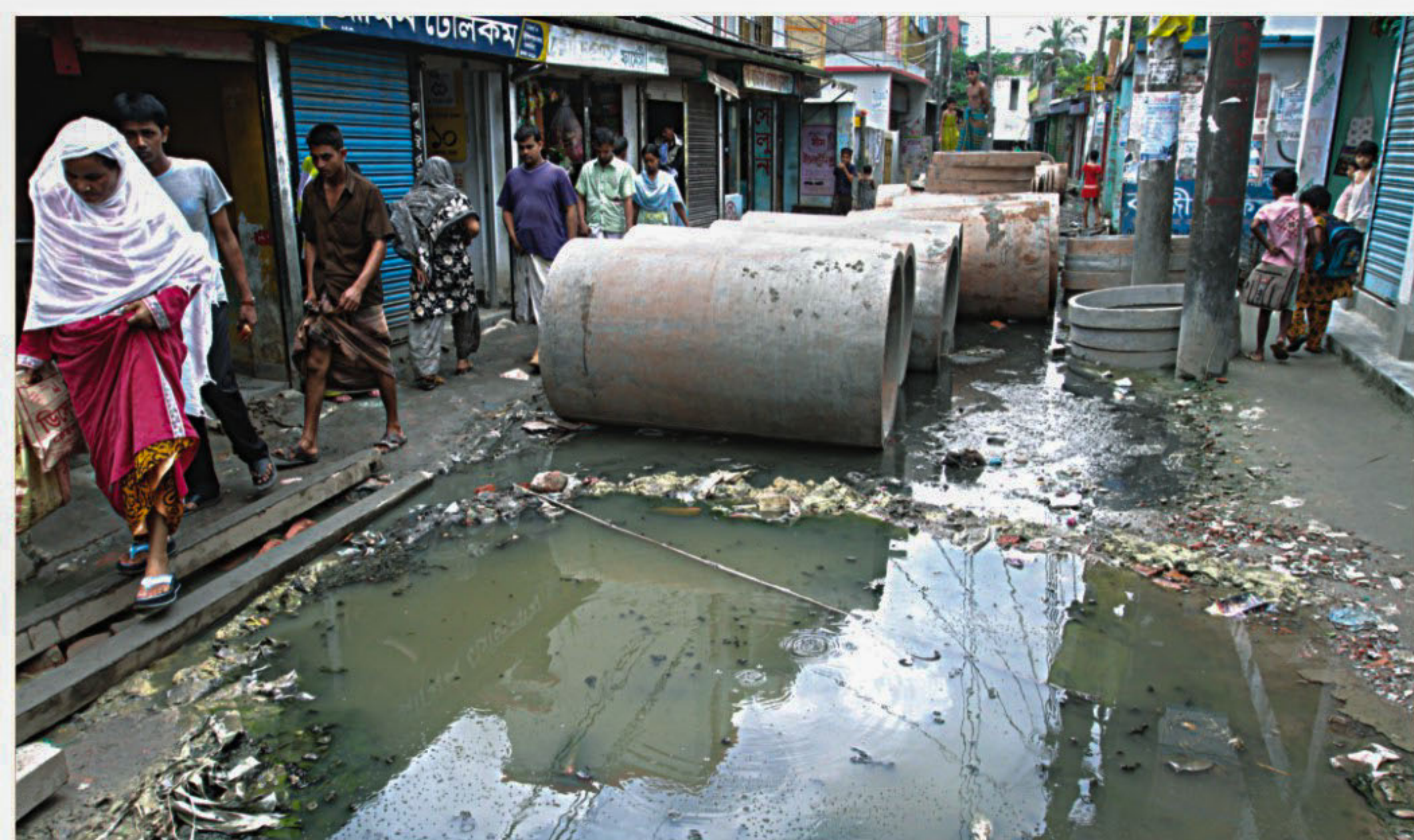
The appalling state of a road in Meradia in the capital. The DCC work was supposed to be finished four months ago.