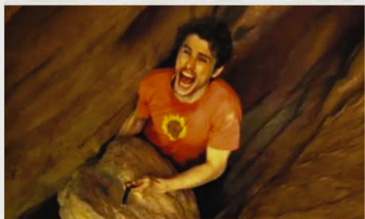
James Franco in "127 Hours".

Boyle is at his directorial best. And this was evident from a standing ovation given