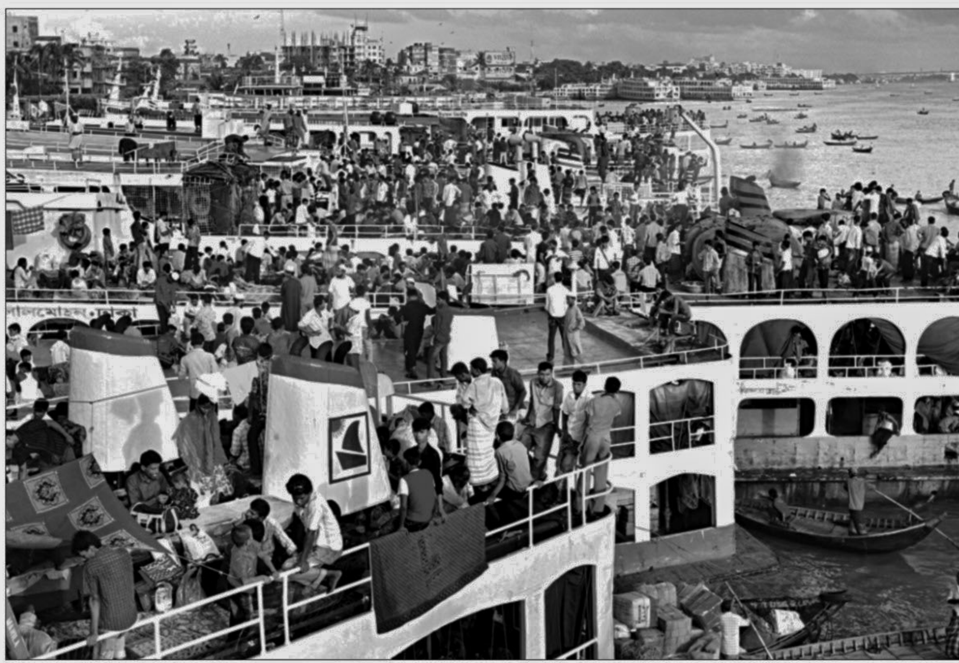
Homebound people through the Sadarghat launch terminal yesterday and embark on the launch roofs even risking life to make sure they are at home before Eid.

Copies of the leaflets are available in police stations and would be distributed to more city areas through newspaper hawkers, said police sources.