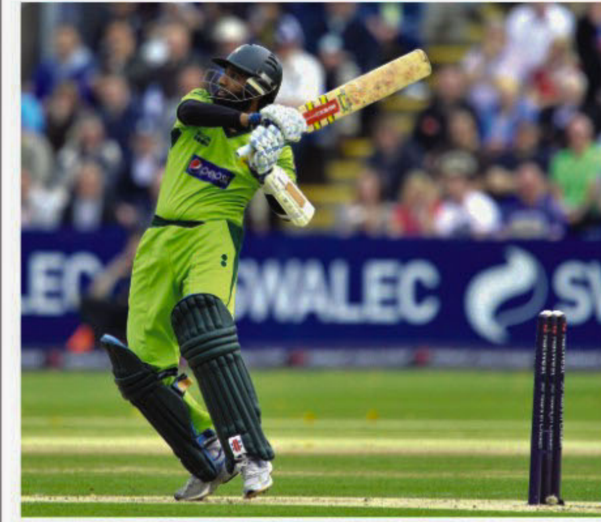
Pakistan batsman Mohammad Yousuf pulls the ball during the Twenty20 against England at the Swalec Stadium in Cardiff yesterday.