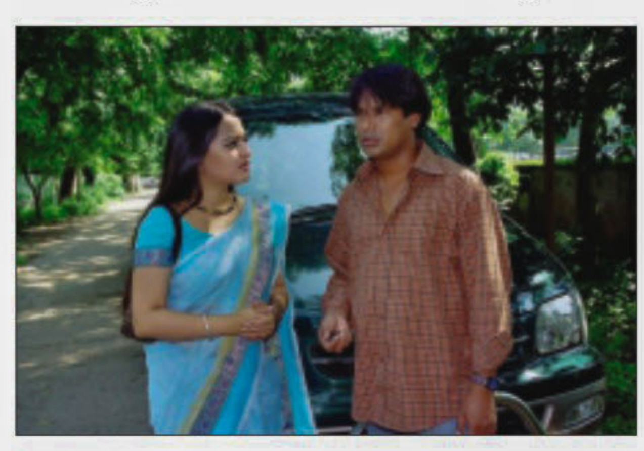
A scene from the serial.