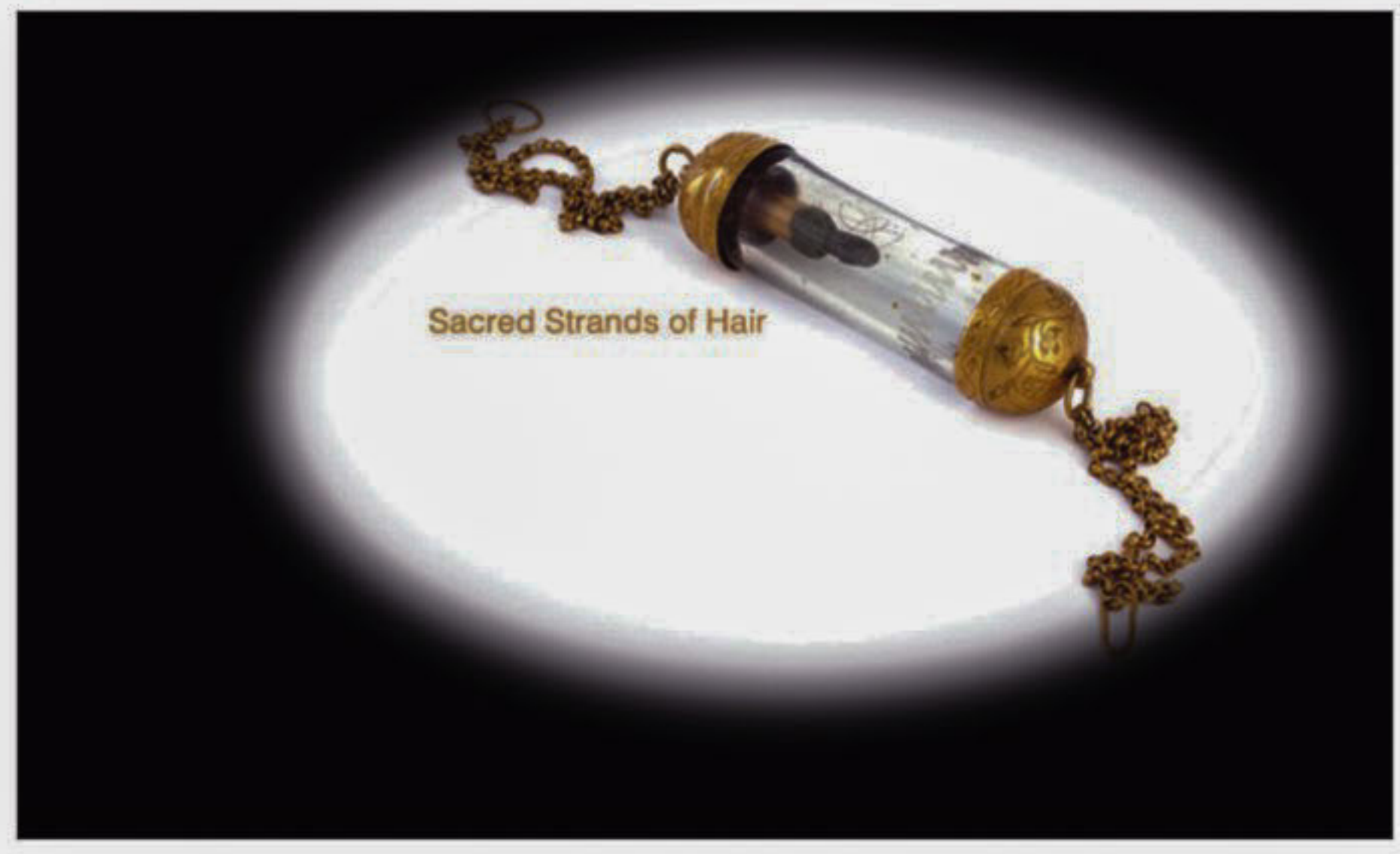
prophets and their family members and associates. Turkish Cultural Centre, Museum, Istanbul has organised the show. The precious originals are housed at the famous Topkapi Palace

A total of 45 photographs are on display at the exhibition, featuring household objects, apparels, swords, shoes, veils used by some