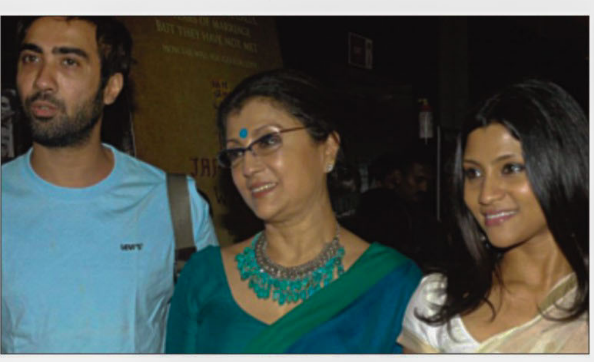
(From left) Ranvir Shorey, Aparna Sen and Konkona.

Bollywood actress Konkona Sen Sharma has confirmed that she has tied the knot with her long-time boyfriend Ranvir Shorey at a private ceremony in Mumbai.