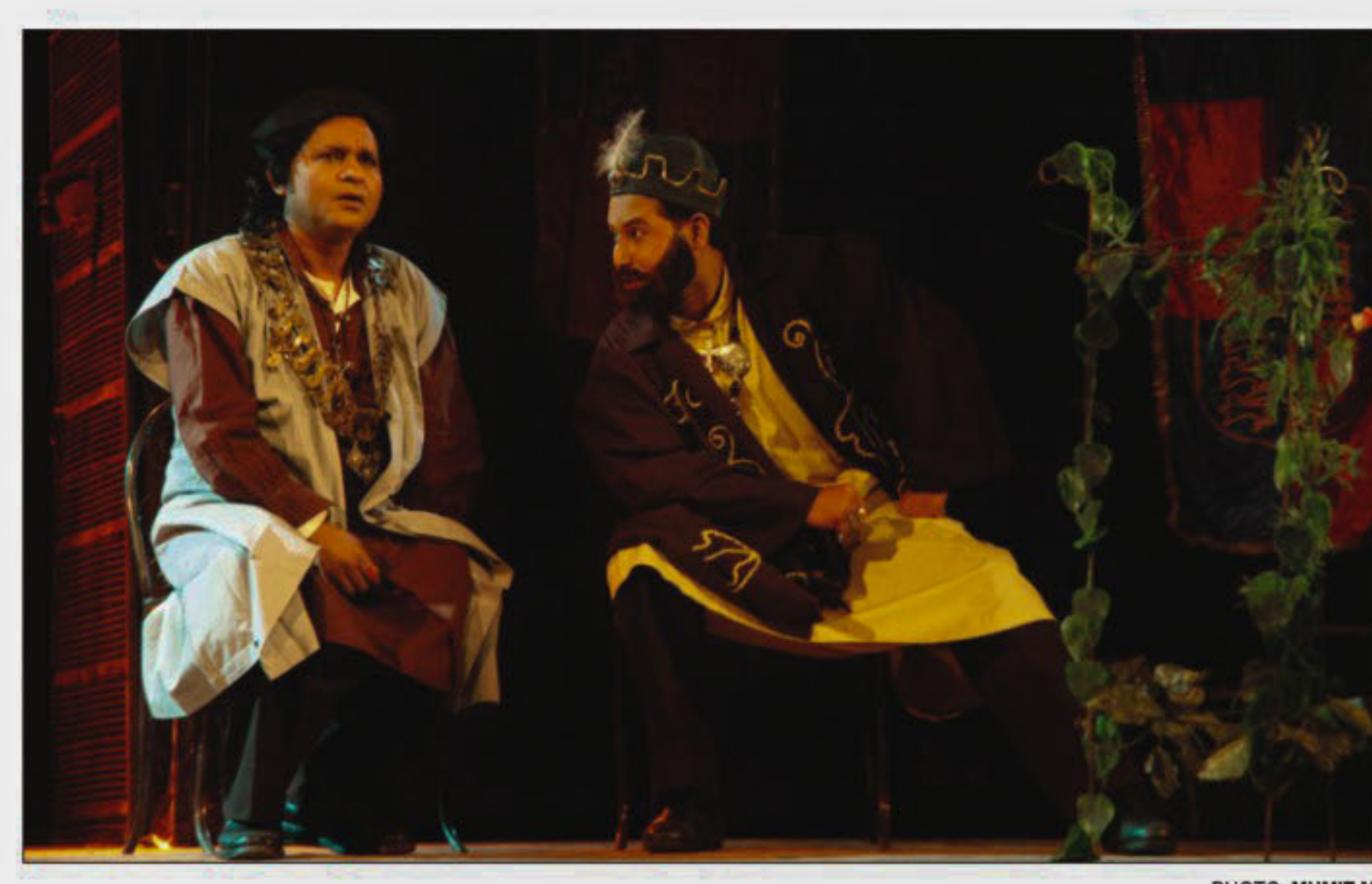
Prachyanat's "A Man for All Seasons" at the current Mahila Samiti Auditorium.