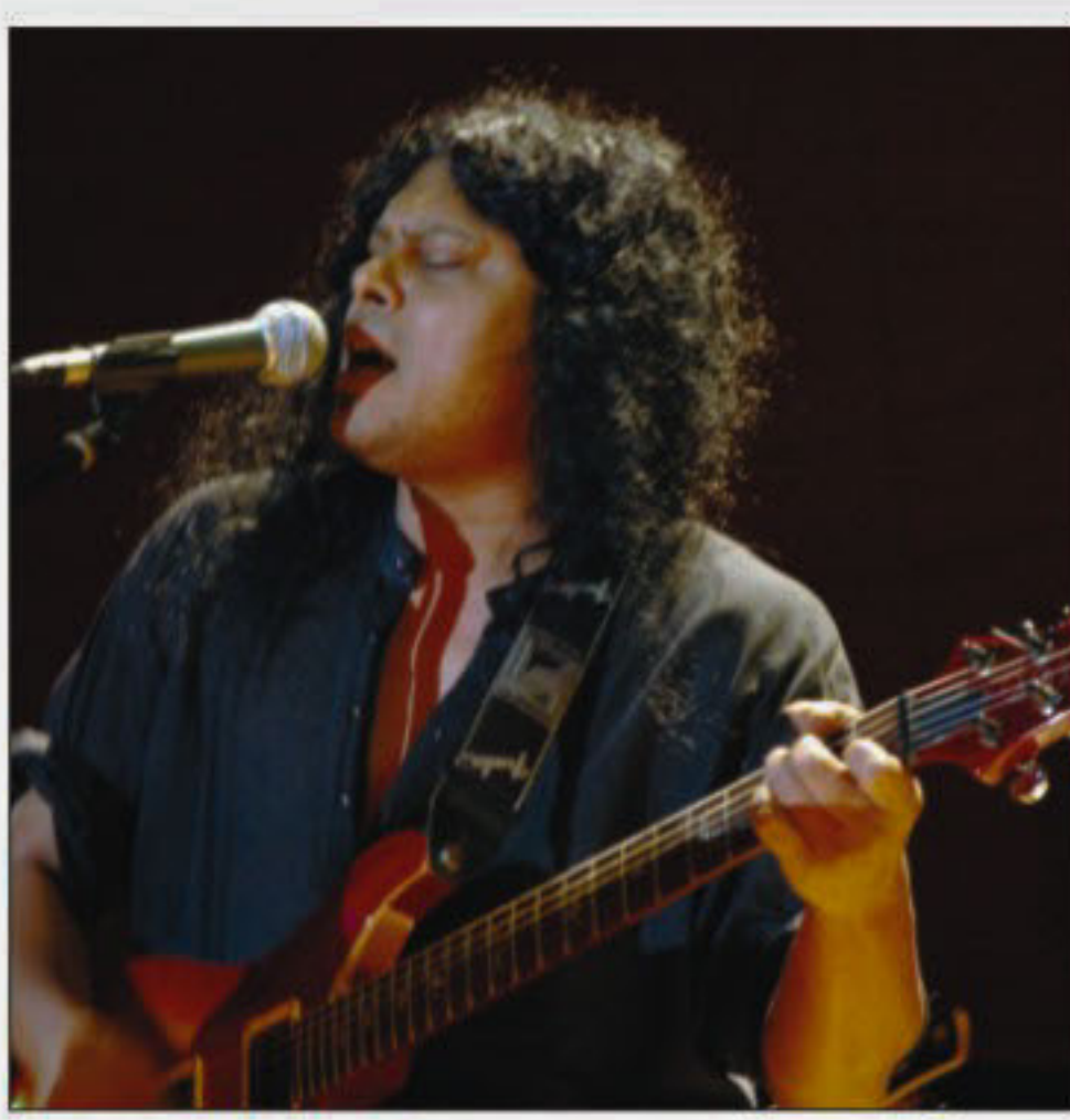
James is one of the featured artistes on the Eid-special programme.