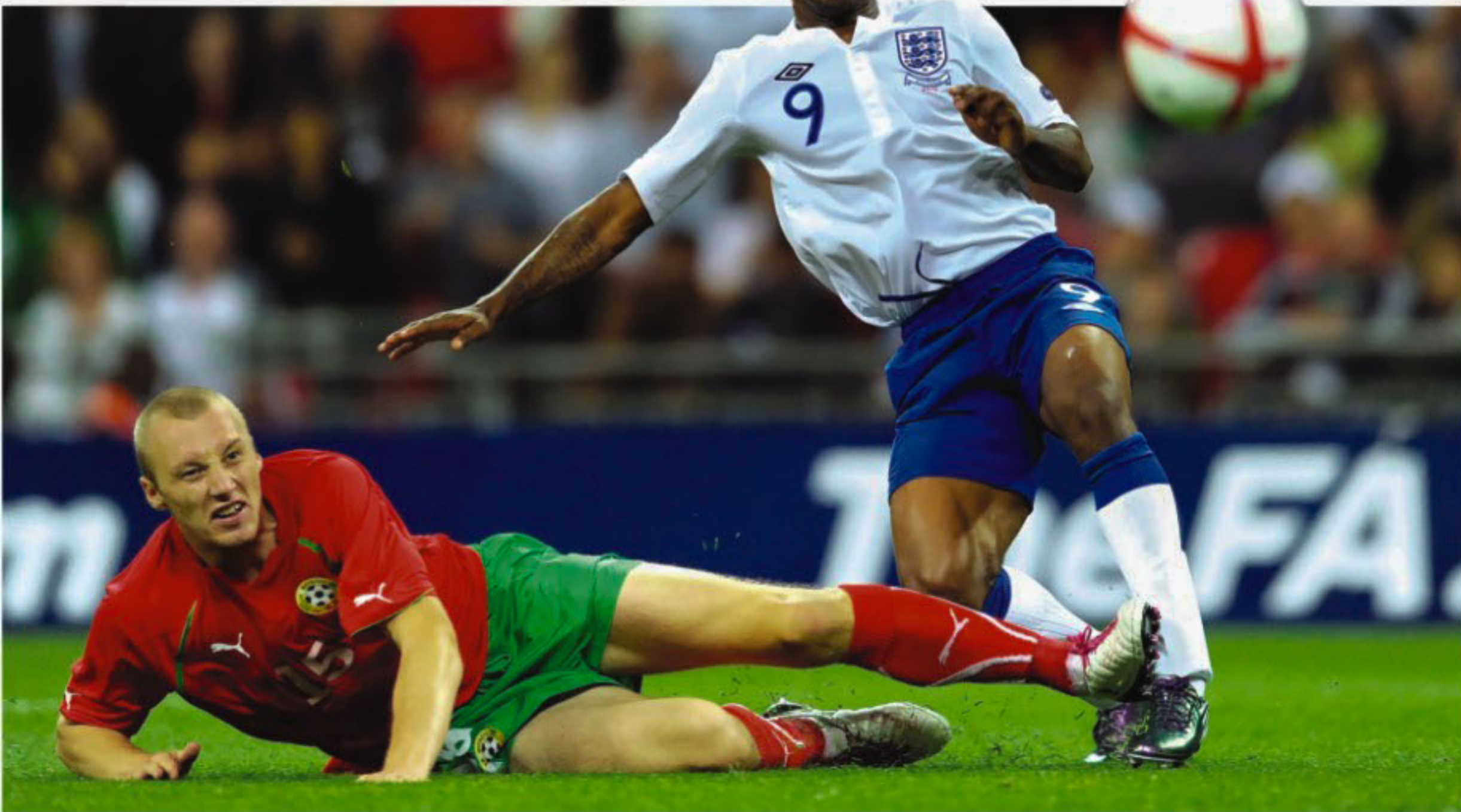
England striker Jermain Defoe (R) shoots past Bulgaria defender Ivan Ivanov to score his hat-trick during their Euro 2012 qualifying encounter at Wembley on Friday.

It was Italy's first win of 2010 and first success in eight matches.