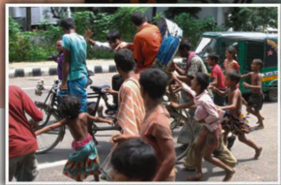
Urchins scramble for clothes as things go out of hand during a clothes distribution ceremony of a social organisation at the Central Shaheed Minar yesterday.