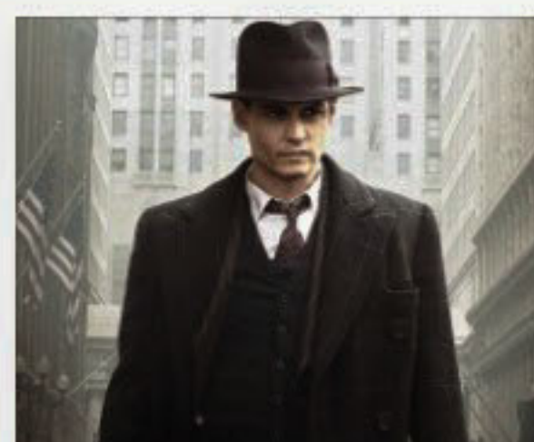
Public Enemies On HBO at 09:30am Genre: Drama/History Cast: Johnny Depp, Marion Cotillard