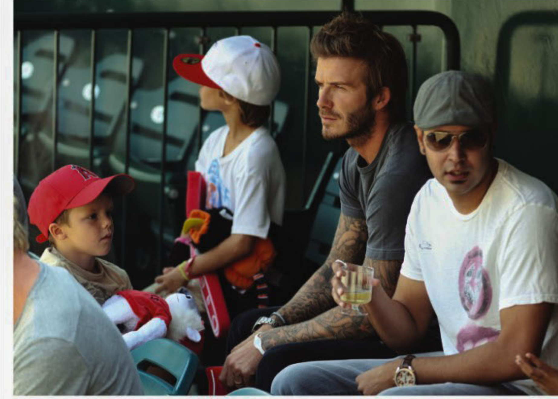
Former England midfielder David Beckham (C) watches a game of baseball between the Baltimore Orioles and Los Angeles Angels of Anaheim at the Angel Stadium last Sunday.

"Not at any point," he said. "When you first have an injury like this and realize how serious an injury it is, you worry that you're not going to get back to playing top flight soccer. But that probably was in my head for only about 10 seconds."