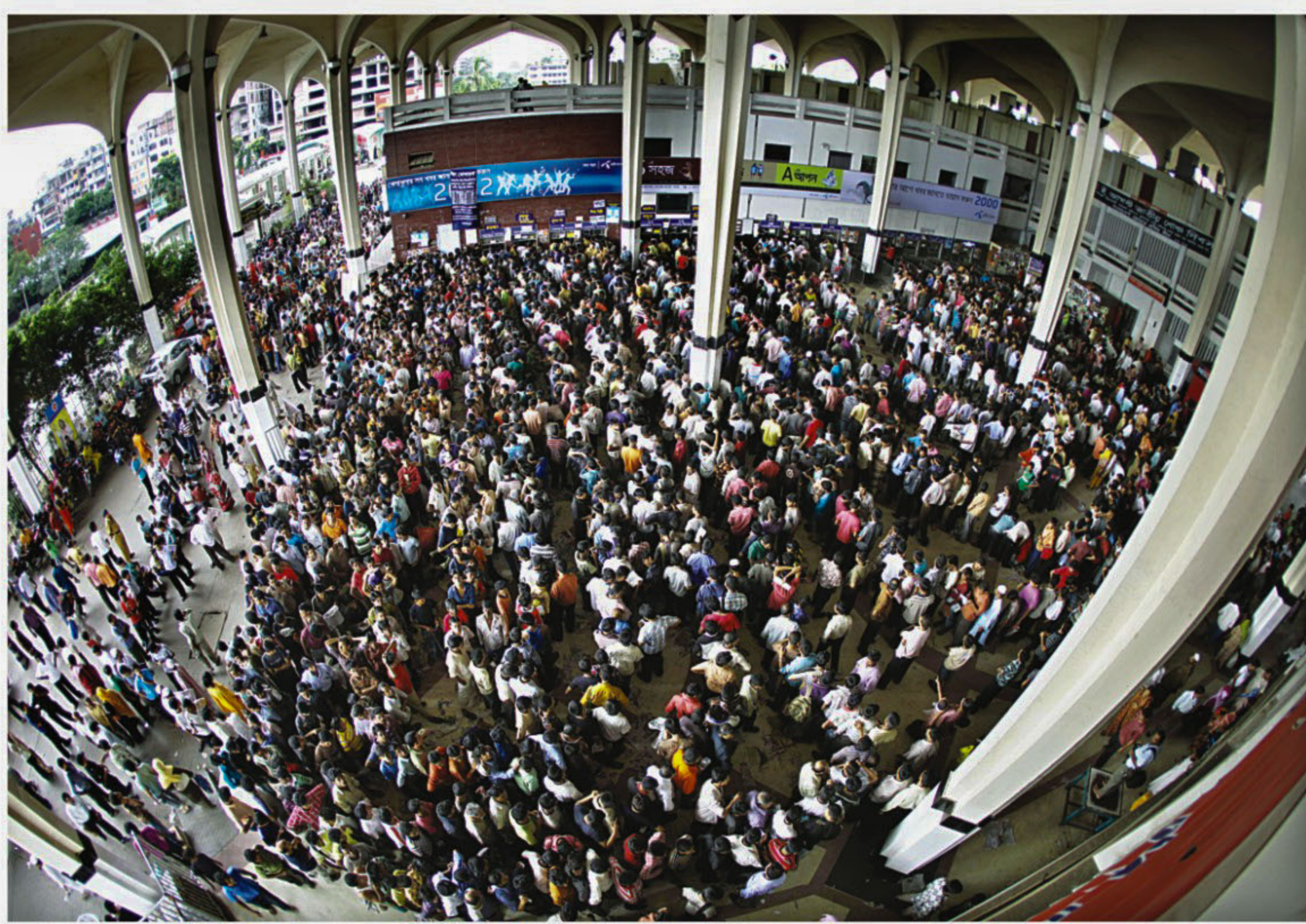
Long queues at ticket counters of Kamalapur Railway Station snake around the entire lobby as people wishing to spend Eid with their families rush yesterday to buy advance train tickets.