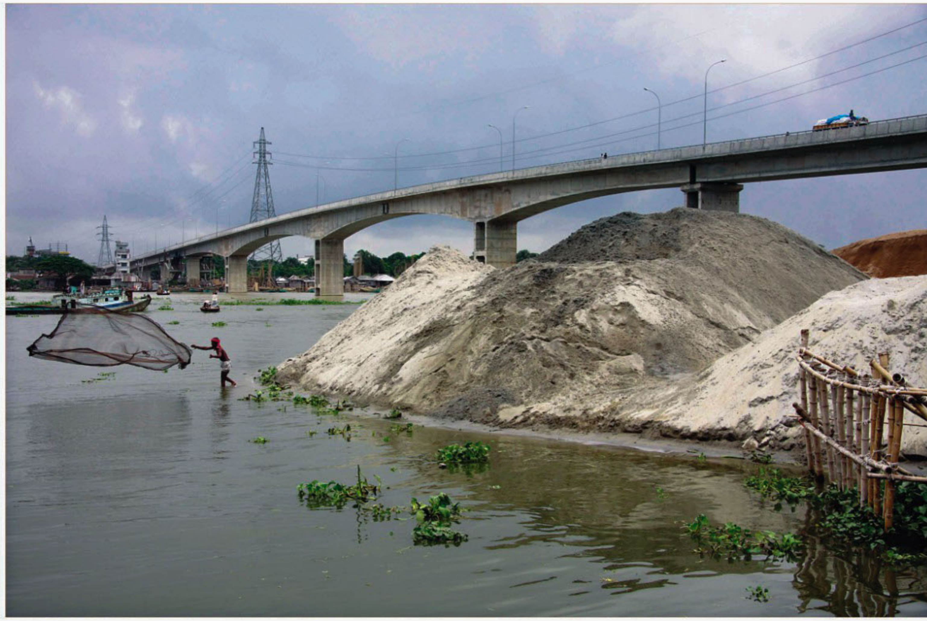
The Sultana Kamal Second Shitalakkhya Bridge in Demra was recently opened to public but influential people have already started encroaching on the river in the name sand business.