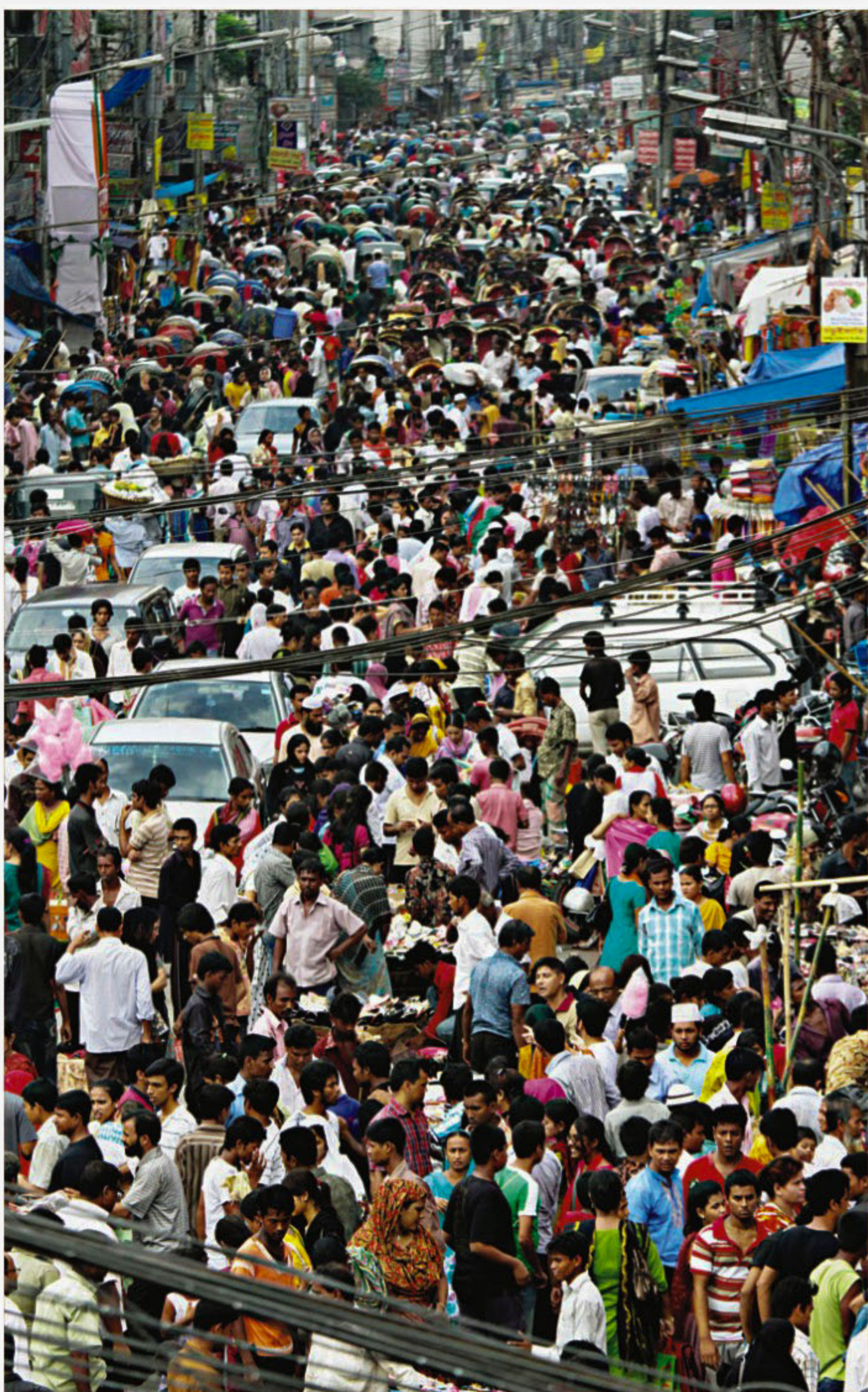
The Eid shopping frenzy kicks into higher gear yesterday on the last weekend ahead of Eid. The photo was taken in front of Gausia Market yesterday.