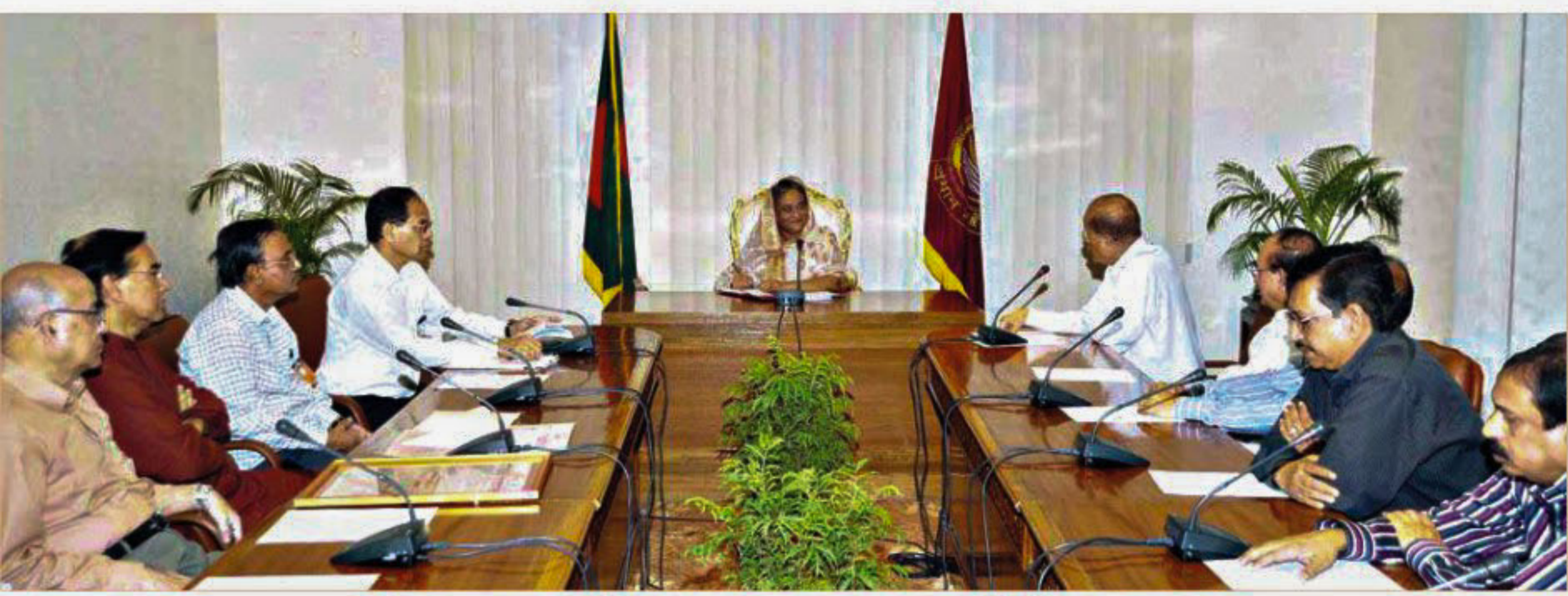
Prime Minister Sheikh Hasina speaks at a meeting with the delegation of Newspaper Owners Association of Bangladesh (Noab) led by its President Mahbul Alam at her office in the city yesterday. (Story on Page 1)