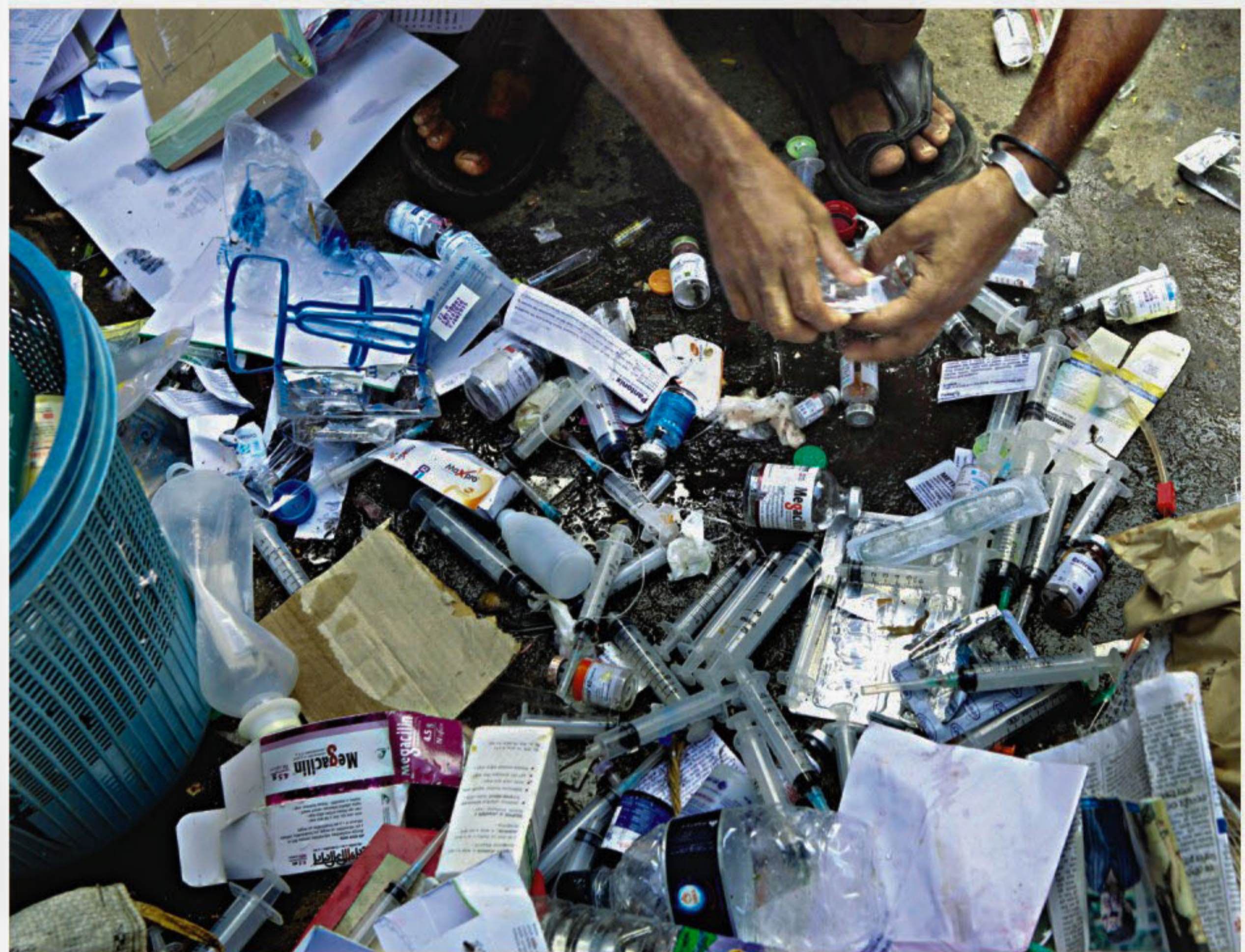
A waste picker collects recyclable materials in a dumpsite at Paribagh in the city yesterday with bare hands risking his life.