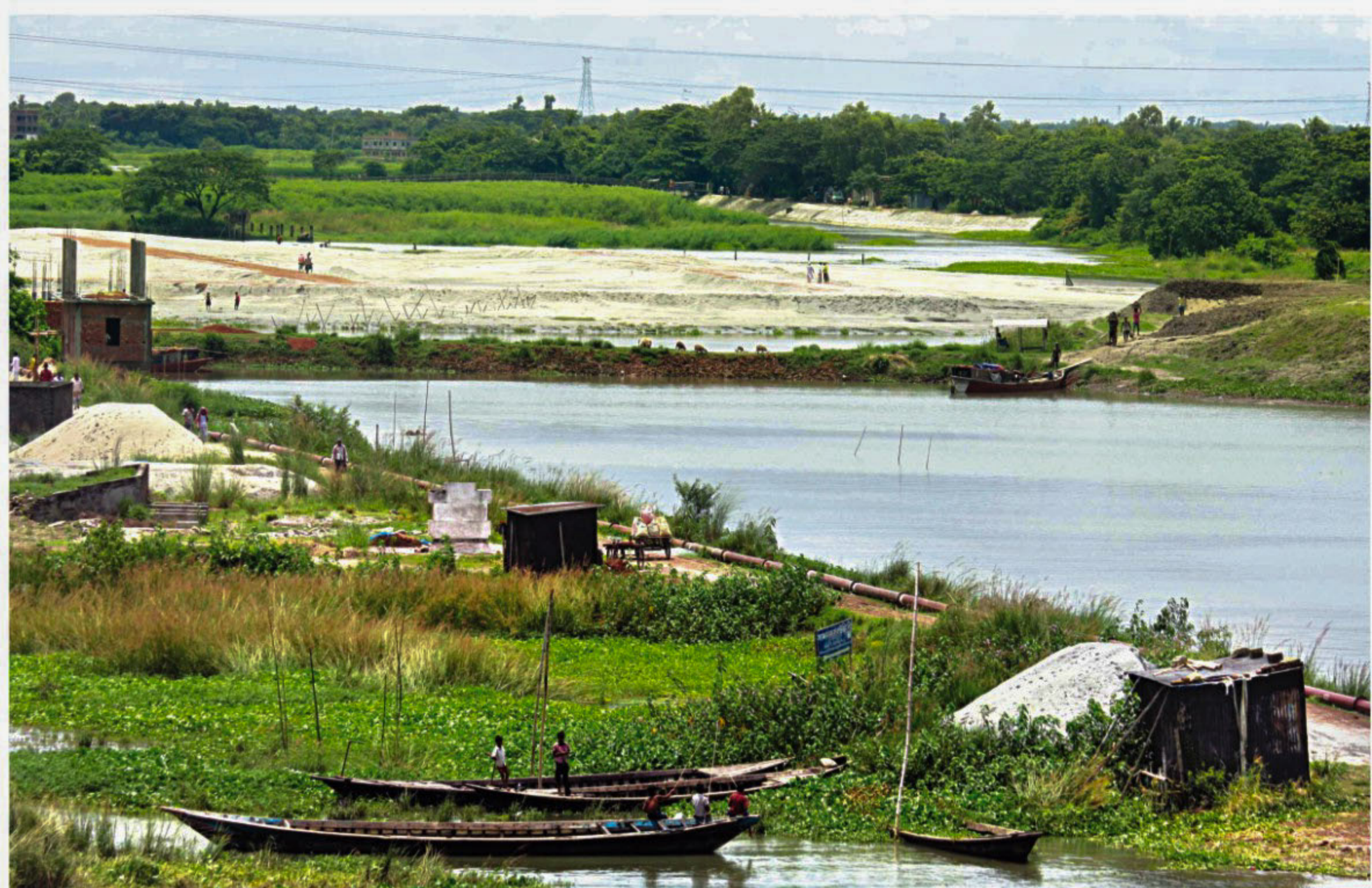
Huge pipes are being used by a real estate developer to dredge silt and fill up Atir Khal at Waaspur on the outskirts of the capital. The photo was taken earlier in the week.

The officials of Waaspur Garden City Cooperative Society said they have legal documents dating back to the British era for the land