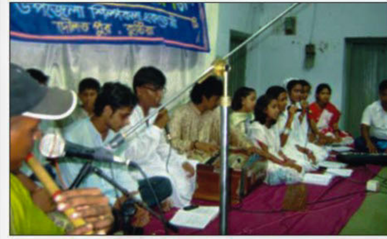
Artists perform at the programme.