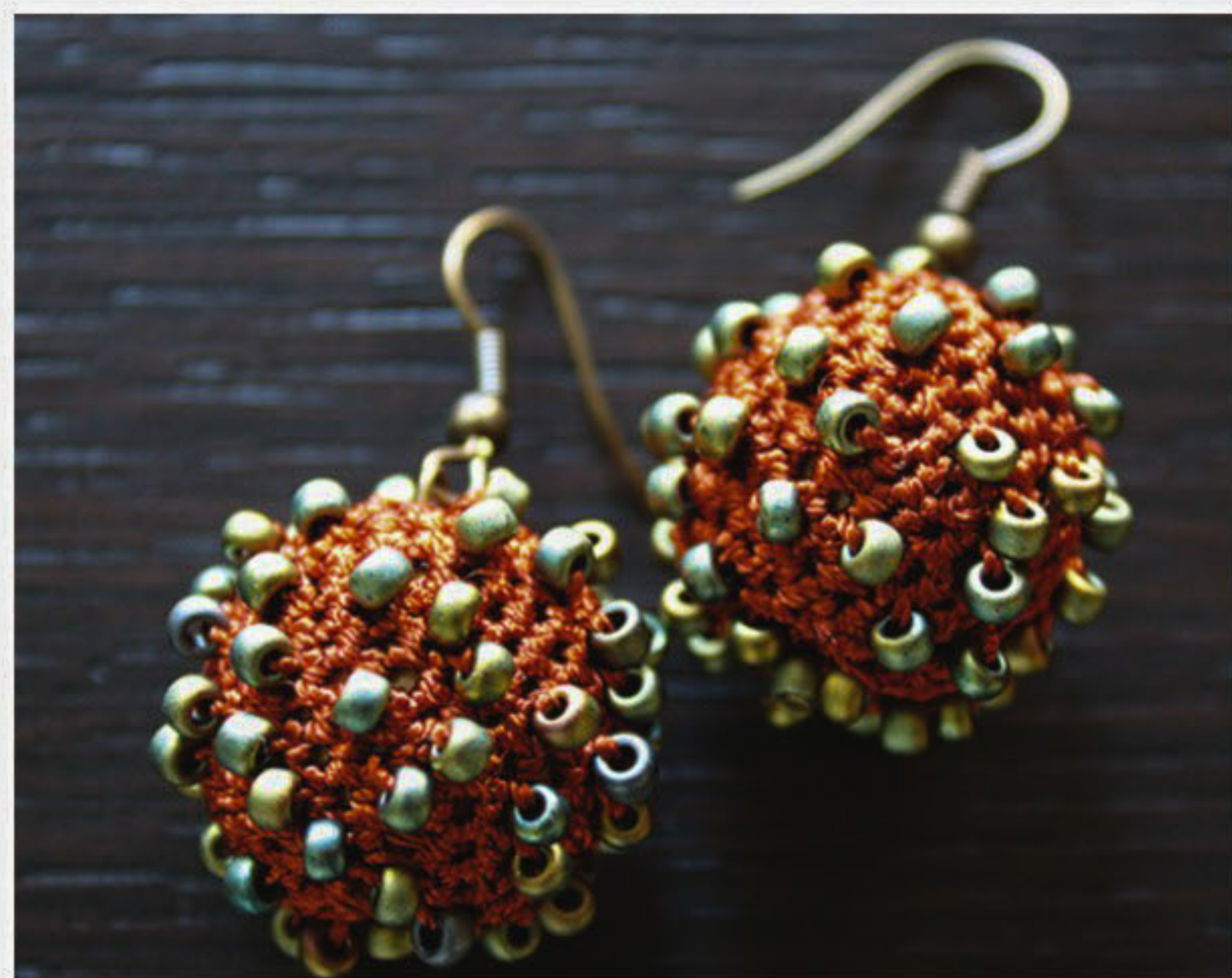
Clay and terracotta jewellery can easily brighten up the get-up, and are reasonably priced.