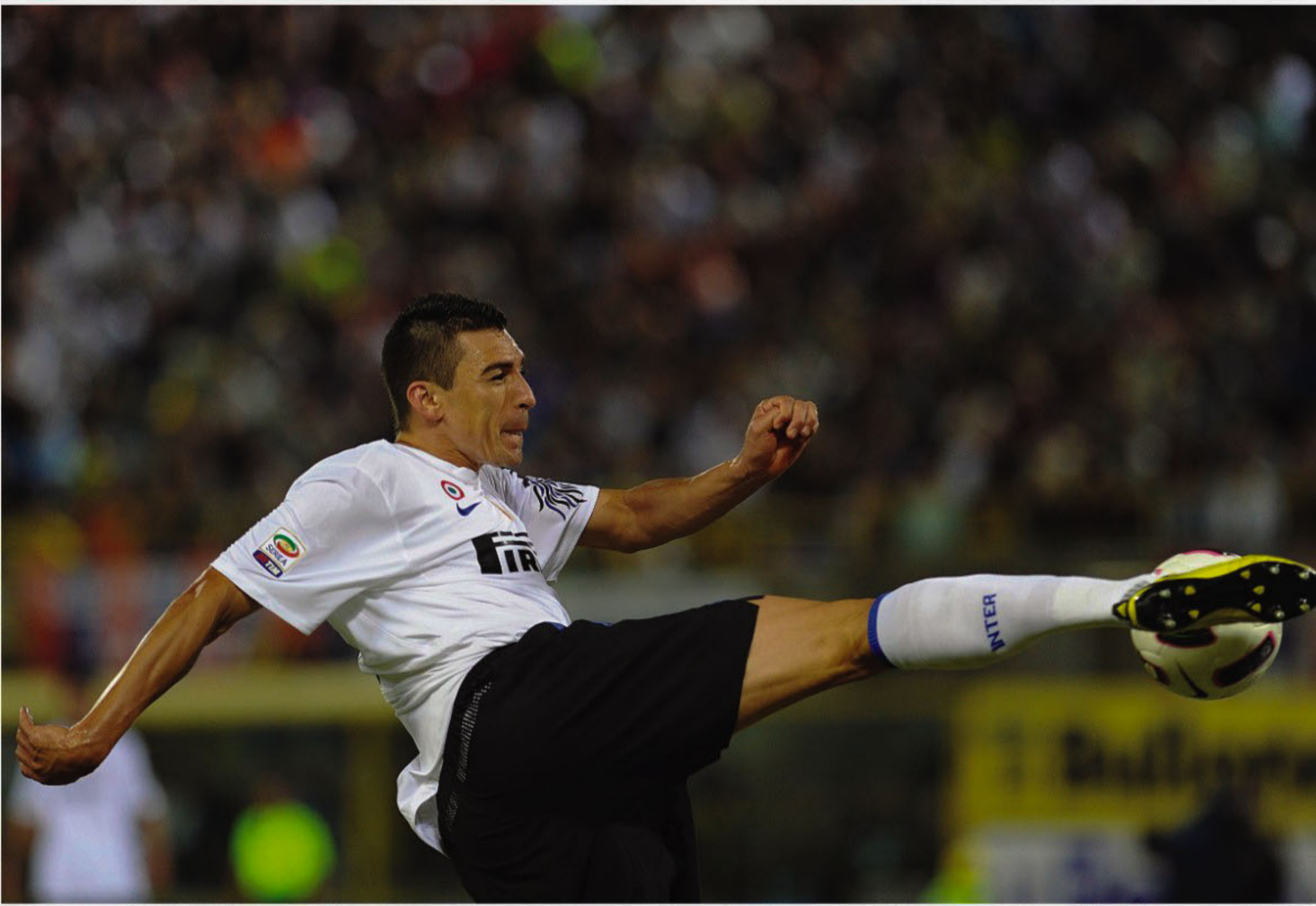
Inter Milan defender Lucio is at full stretch to kick the ball during their Serie A encounter against Bologna at the Dall'Ara Stadium on Monday.