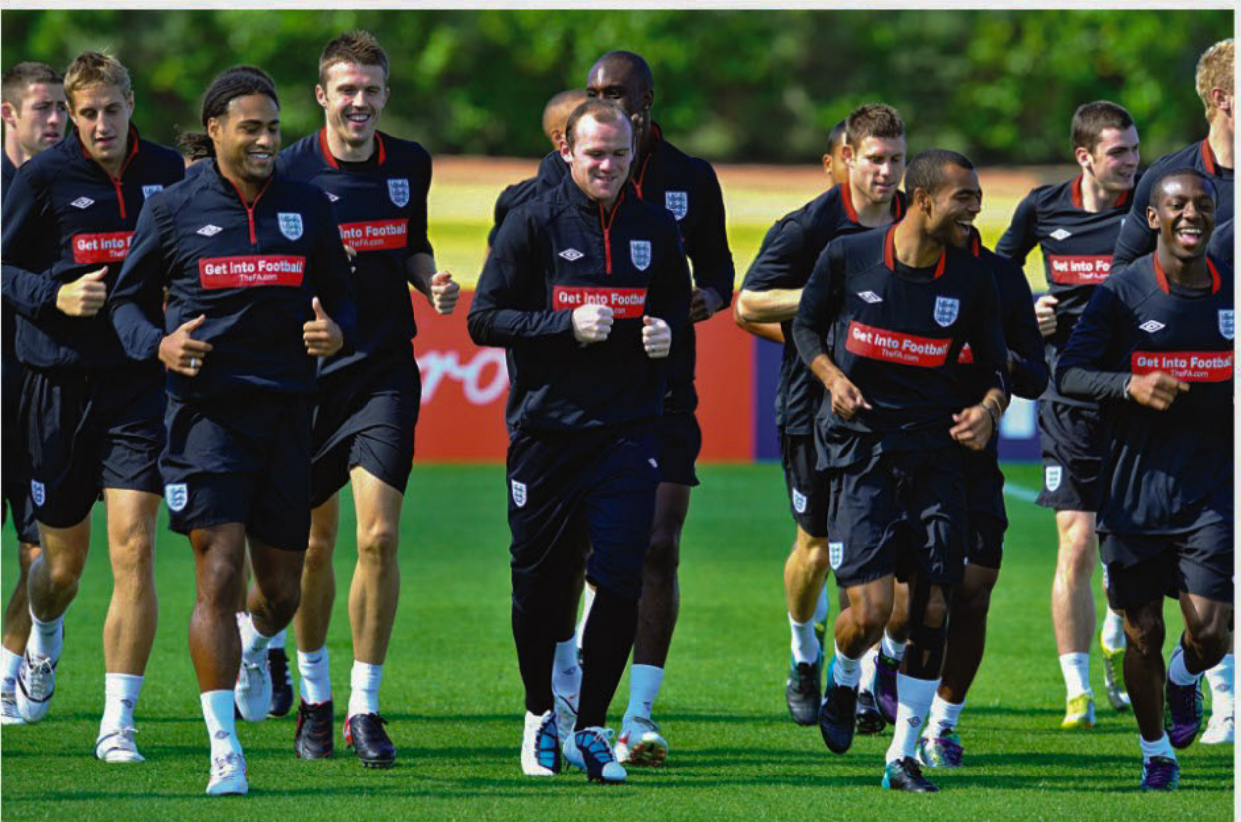
England players jog during a training session at London Colney yesterday. England take on Bulgaria in a Euro 2012 qualifying match on Friday.

"It won't be a stroll in the park against Estonia, they're a tight outfit, we'll have to be careful."