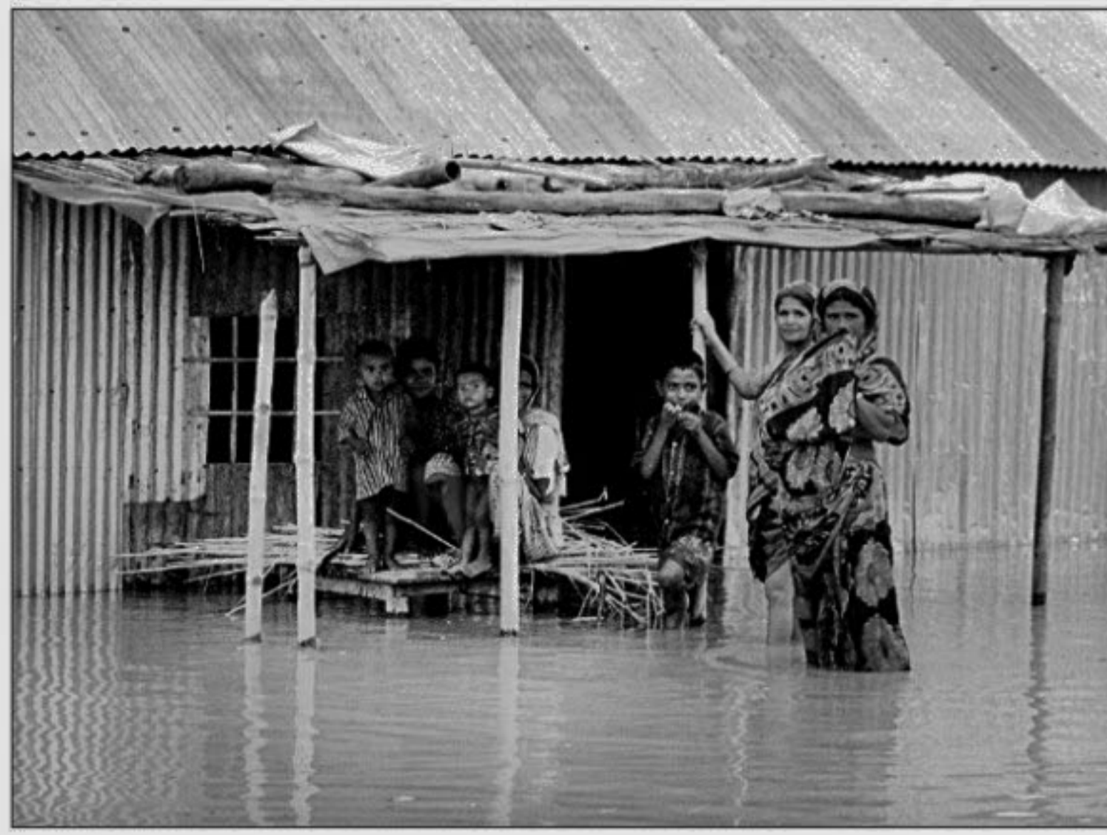
A family remains marooned at Char Guabari village in Saghata upazila of Gaibandha district, right, Singria Government Primary School in the same upazila is cut from surrounding areas due to the flooding by the Jamuna.

The arrestees were produced in the Judicial Magistrate's court here yesterday, seeking a seven-day remand. After hearing, the court granted four days' remand.