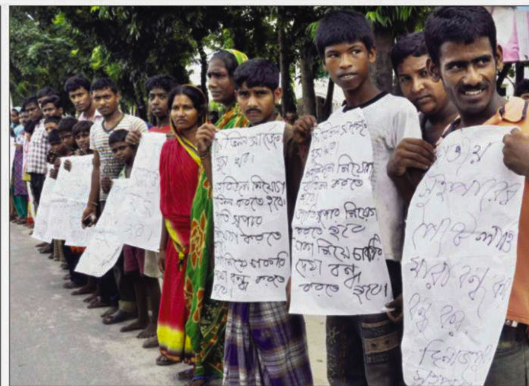
People of Harijan community form a human chain in front of Dinajpur Deputy Commissioner's Office yesterday demanding cancellation of recent sweeper recruitment, done through alleged bribery, at Dinajpur Civil Surgeon's office.