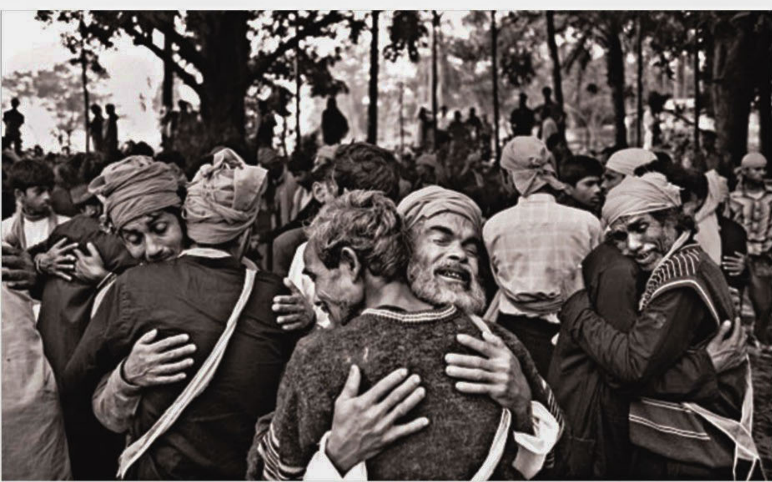
"In Bangladesh, Islam is like the many colours produced by a mirror in the sunlight" -- Munem Wasif

Munem Wasif's photo series at French photojournalism festival